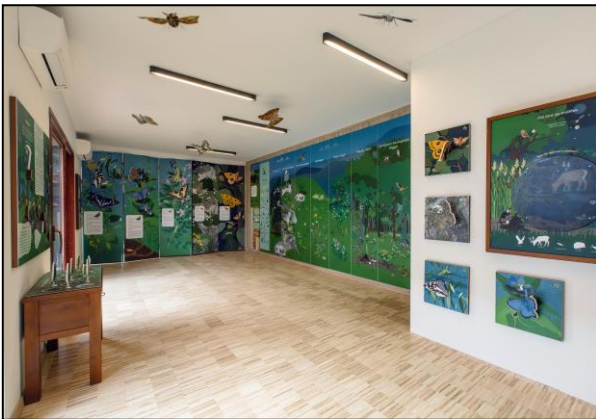
1. Figure: The new exhibition (Zalán Biros)