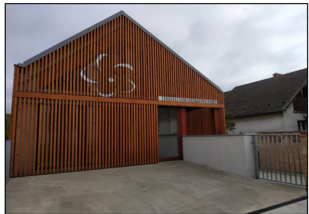
2. Figure: The new building (Réka Karlné Menráth)