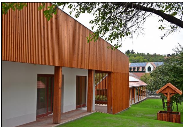
3. Figure: The new garden of the visitor centre (Gyöngyi Berkó)