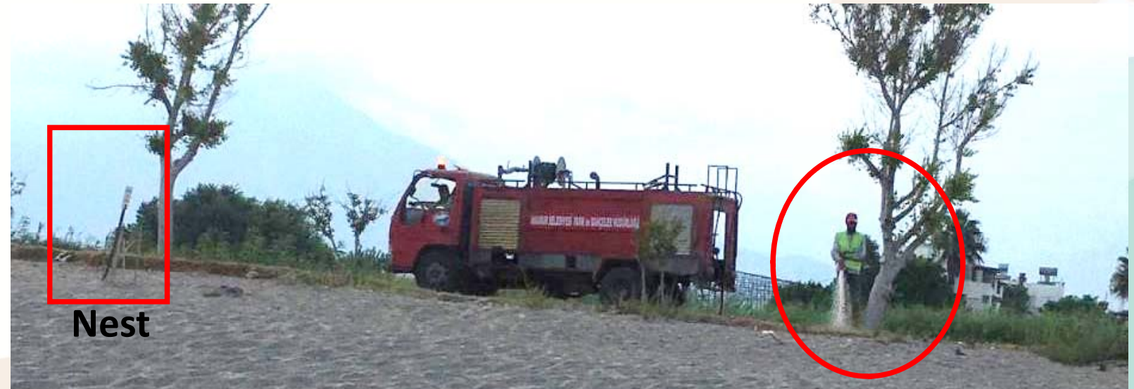
Continued irrigation of the site, 10 th August 2020 ©2020 MERÇED