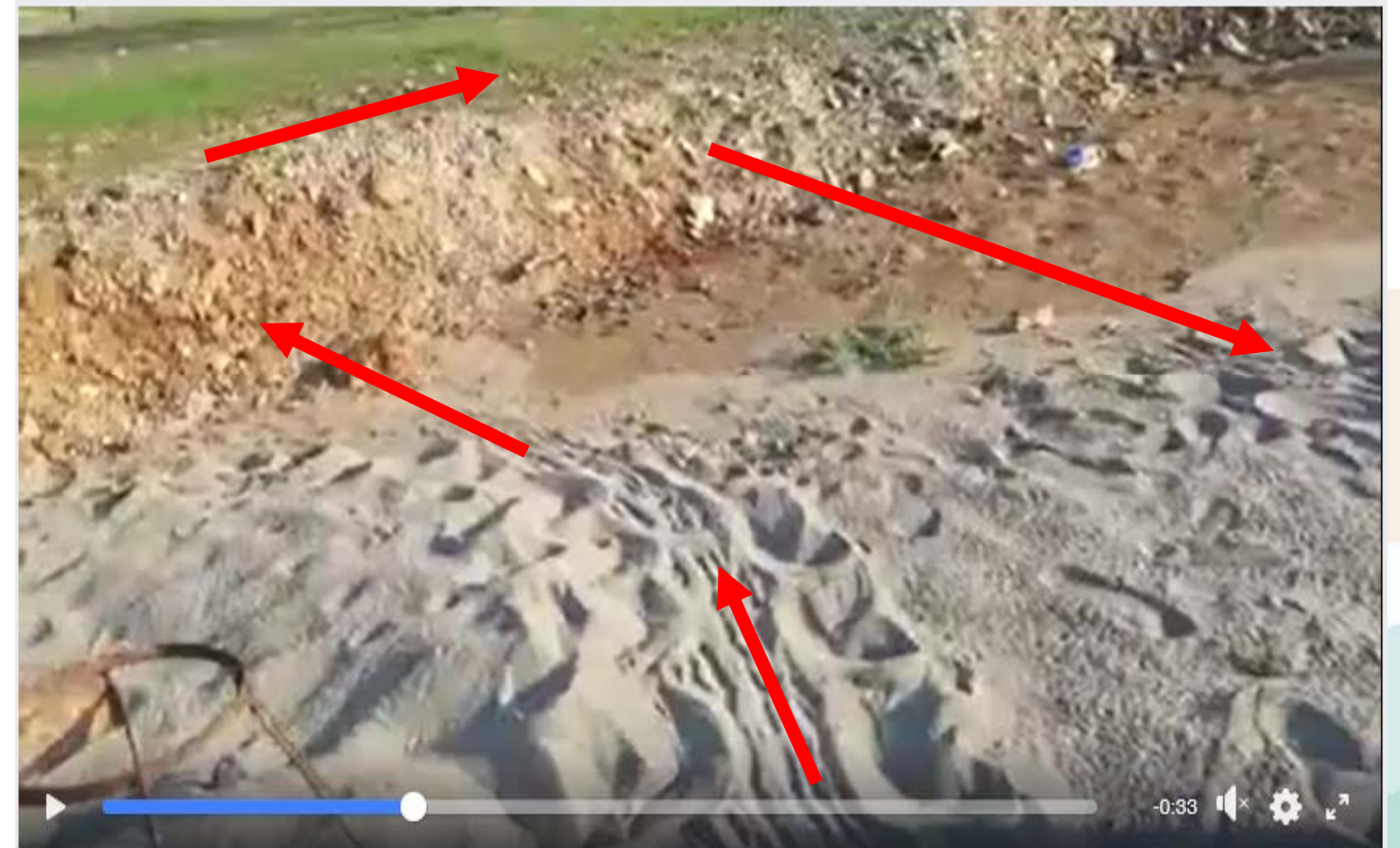
Anamur Çevre Platformu 27 Ιουλίου στις 10:26 π.μ. · 🌐 · 📍 · 🗣️ FAILED nesting attempt Video recorded 27 th July https://www.facebook.com/949710881892145/videos/2391783101110906