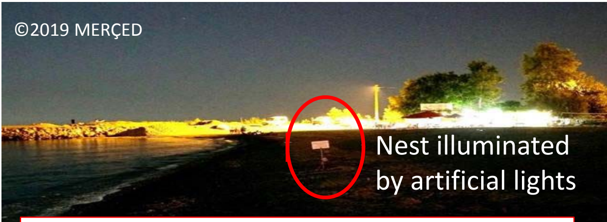
Light Pollution at night on the nesting beach