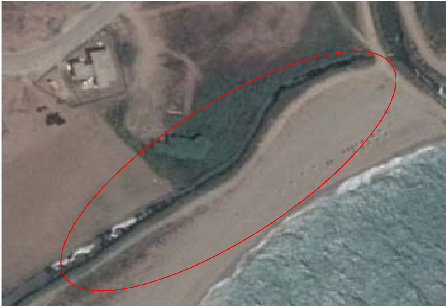
BEFORE construction-natural habitat at Karaağaç Beach

Pre-Allocated Area of Karaağaç Picnic Area – c.4.660m 2