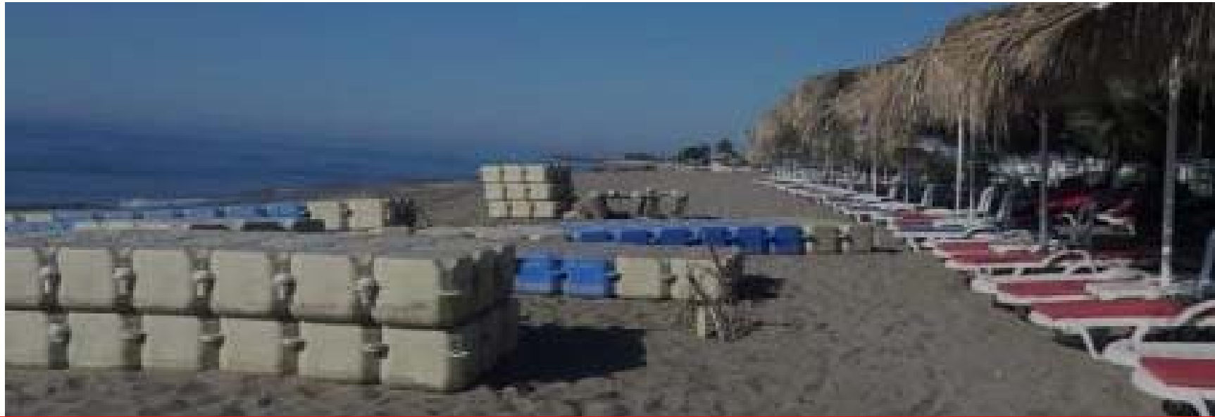
Beach Furniture placed anywhere and not removed at night