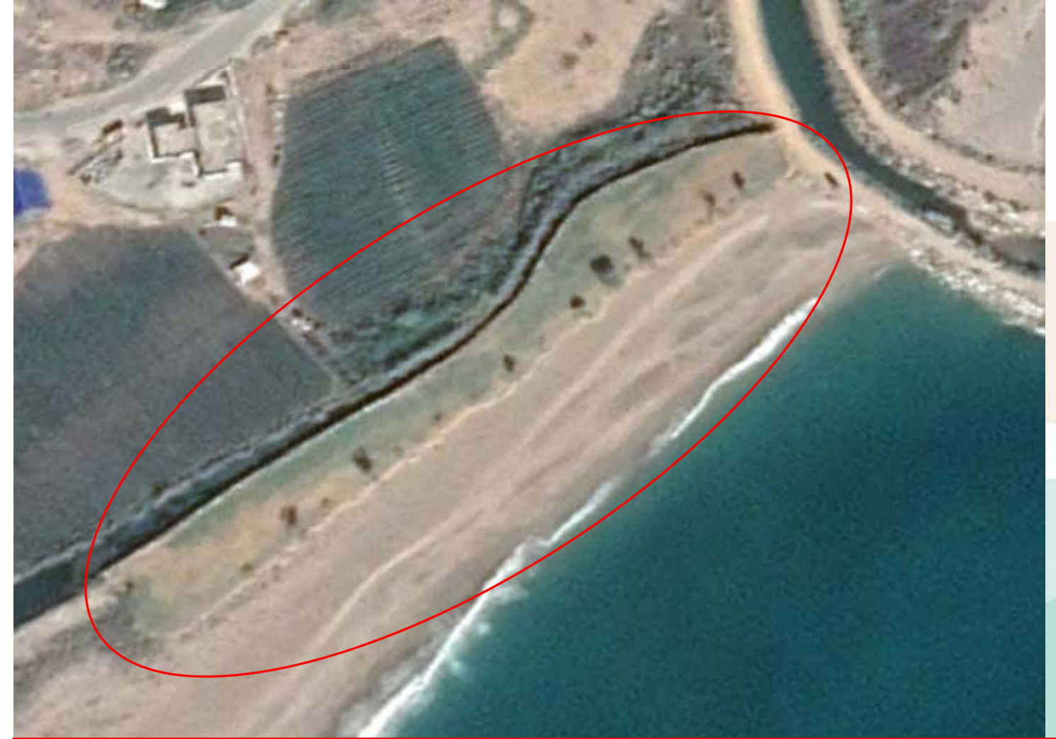
GoogleEarth Image 05.11.2019: AFTER construction-loss of protected nesting habitat.