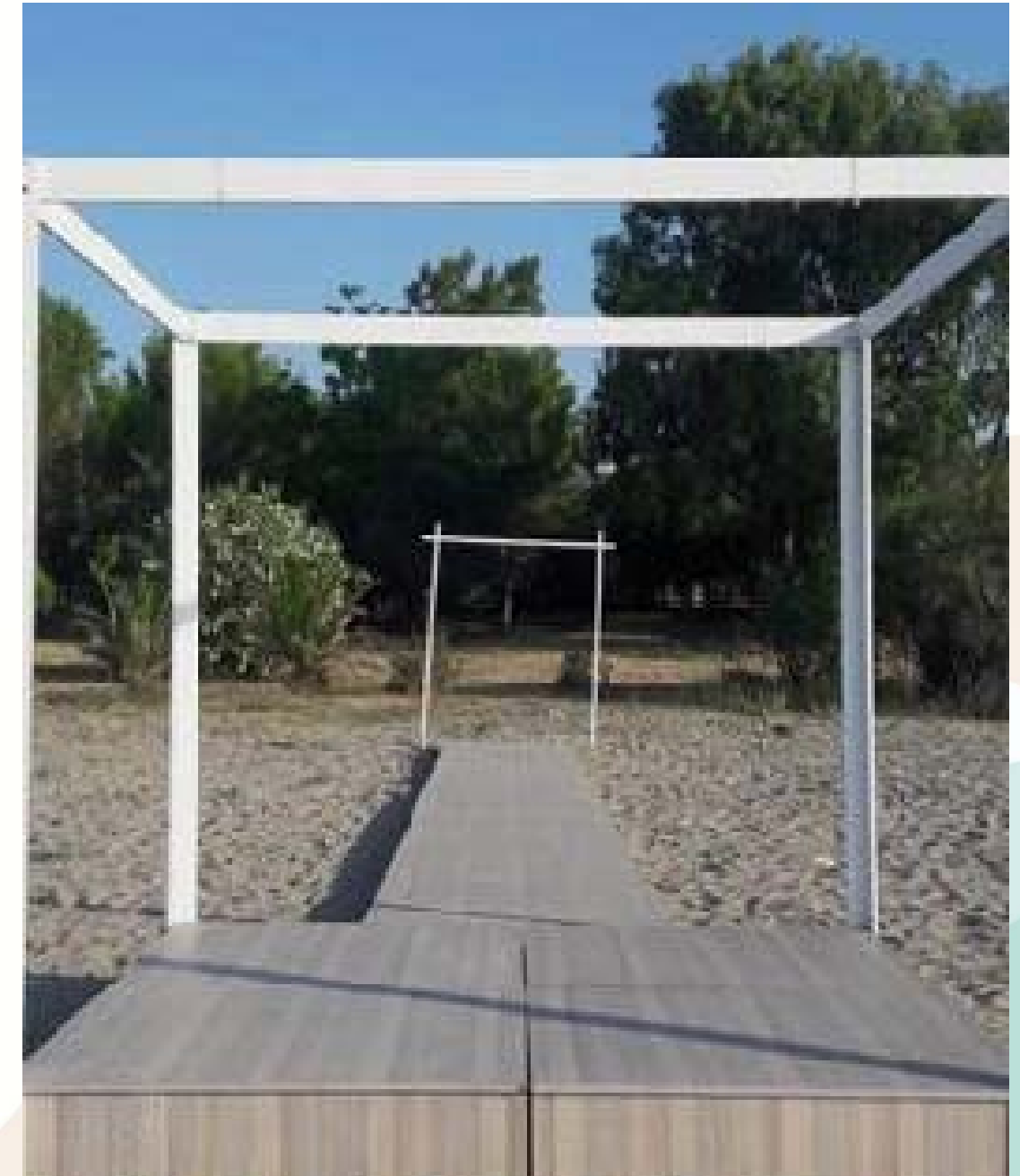
Wedding ceremony platform on the beach