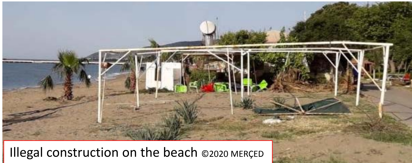
Illegal construction on the beach