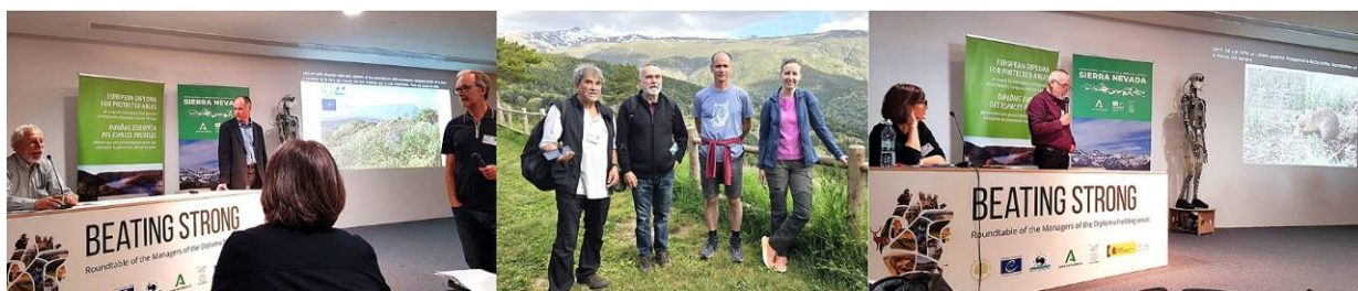
The Hungarian EDPA representatives attended the 60 th anniversary Granada meeting