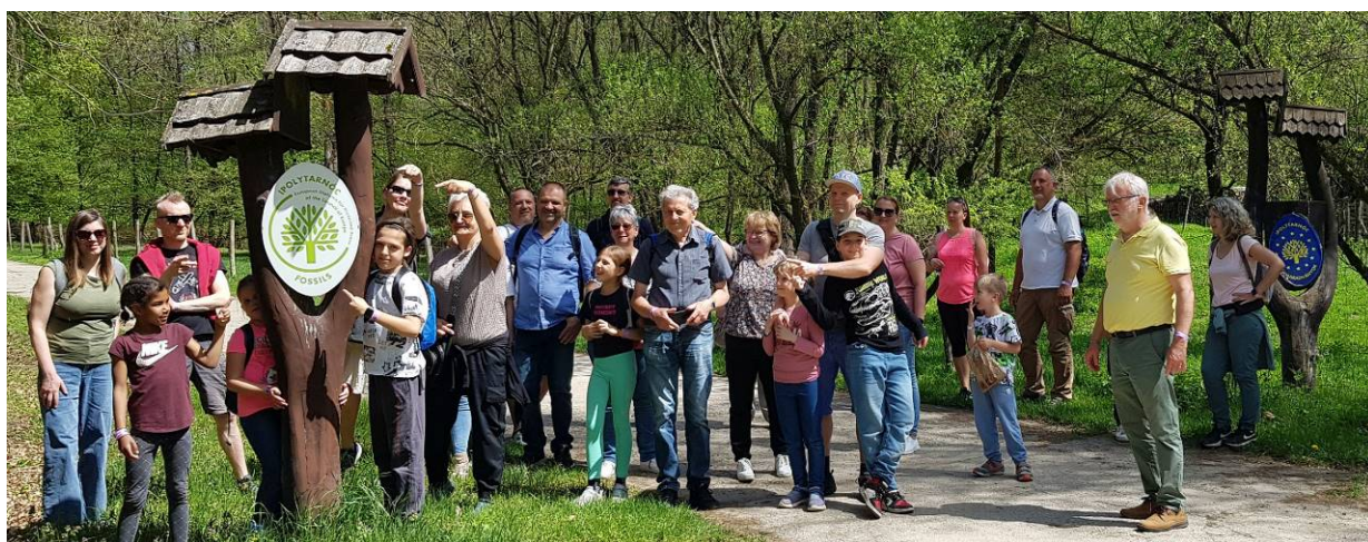
Visitors at the European Diploma logo sign on Mother Earth Day 2025

Despite the economic crisis and other difficulties, such as the decline in visitor numbers, the site remains one of the main geotourism centers and heritage conservation sites in the region. IFEDPA has a stable place on the Tentative List of World Heritage Sites in Hungary, it is the flagship of the NNUGGp, where the importance of the European Diploma is also duly highlighted.