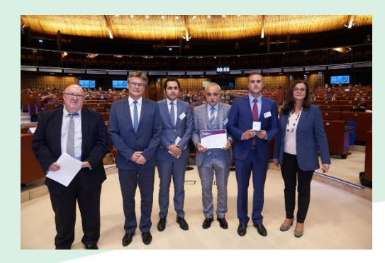
Ceremonies (eg Dosta!)