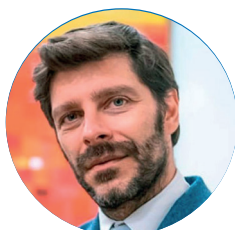
Nicholas YATROMANOLAKIS Deputy Minister of Culture and Sports, Greece