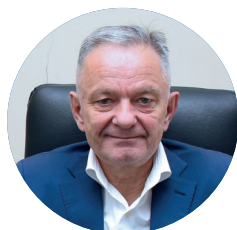
Kakha SIKHARULIDZE First Deputy Minister of Culture, Sport and Youth of Georgia