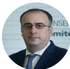
Amb. Irakli GIVIASHVILI Permanent Representative of Georgia to the Council of Europe