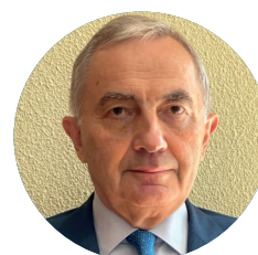
Amb. Lazăr COMĂNESCU Secretary General, Permanent International Secretariat, Organization of the Black Sea Economic Cooperation (BSEC PERMIS)