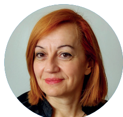
Tatjana HORVATIĆ Head of Movable, Ethnographic and Intangible Cultural Heritage Office, Directorate for the Protection of Cultural Heritage, Ministry of Culture and Media of Croatia