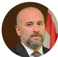
Zviad SHALAMBERIDZE Governor of the Imereti Region, Georgia