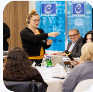
Civil servants and professionals enhance their capacity in effective guardianship of unaccompanied and separated children October 2024

The Council of Europe HELP courses on "Migrant and Refugee Children" and "Protection of Children against Sexual Exploitation and Abuse" adapted to the national context which increased knowledge and skills of over 70 professionals