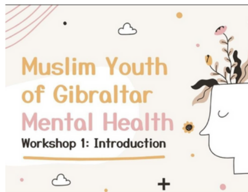
Mental Health Introduction workshop – Muslim Youth of Gibraltar

https://www.instagram.com/p/CcnNw3bKLbn/?igshid=YmMyMTA2M2Y=