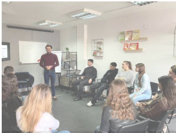
Emotional intelligence training – FRI (North Macedonia)