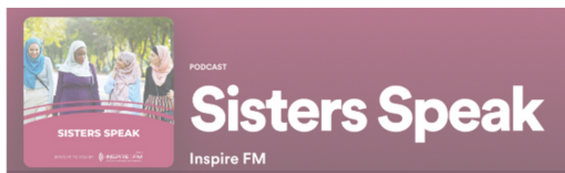
Radio Inspire FM – Sisters Speak (UK)

Outreach : Couple of thousands listeners – Sisters Speak – Inspire FM