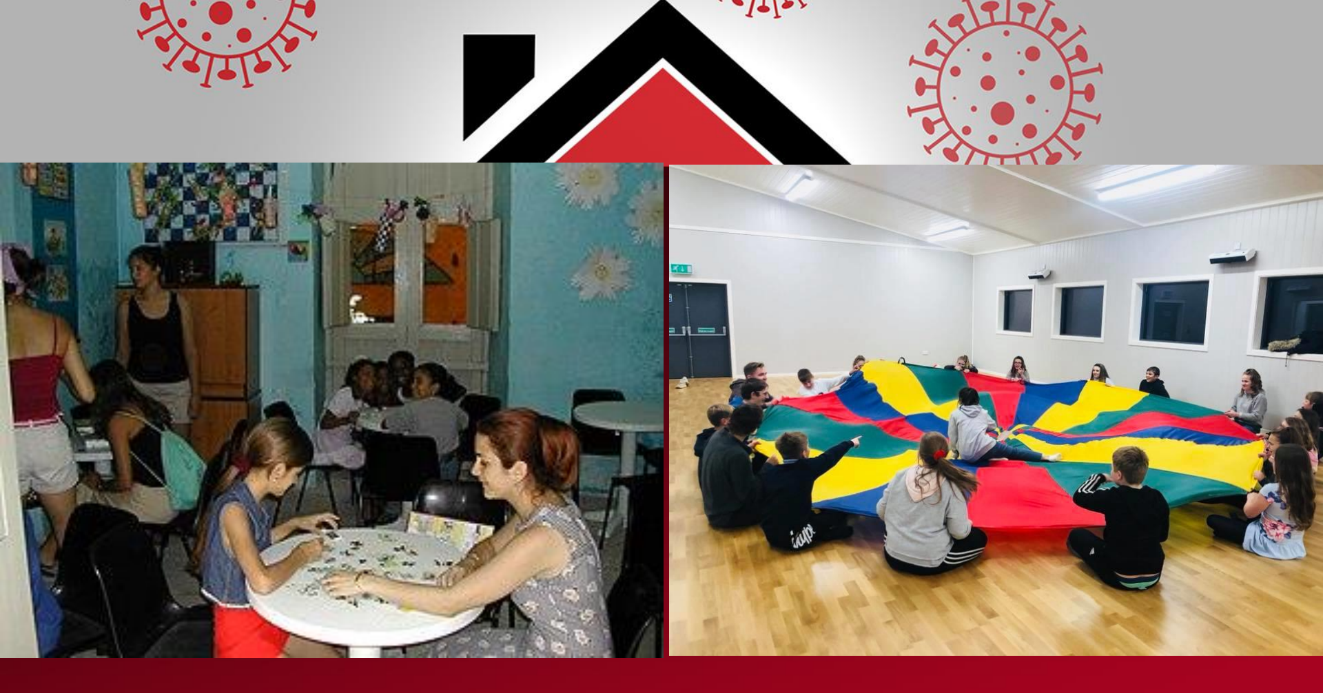
THE NEED OF Space, space and more space FOR YOUNG PEOPLE TO ENGAGE