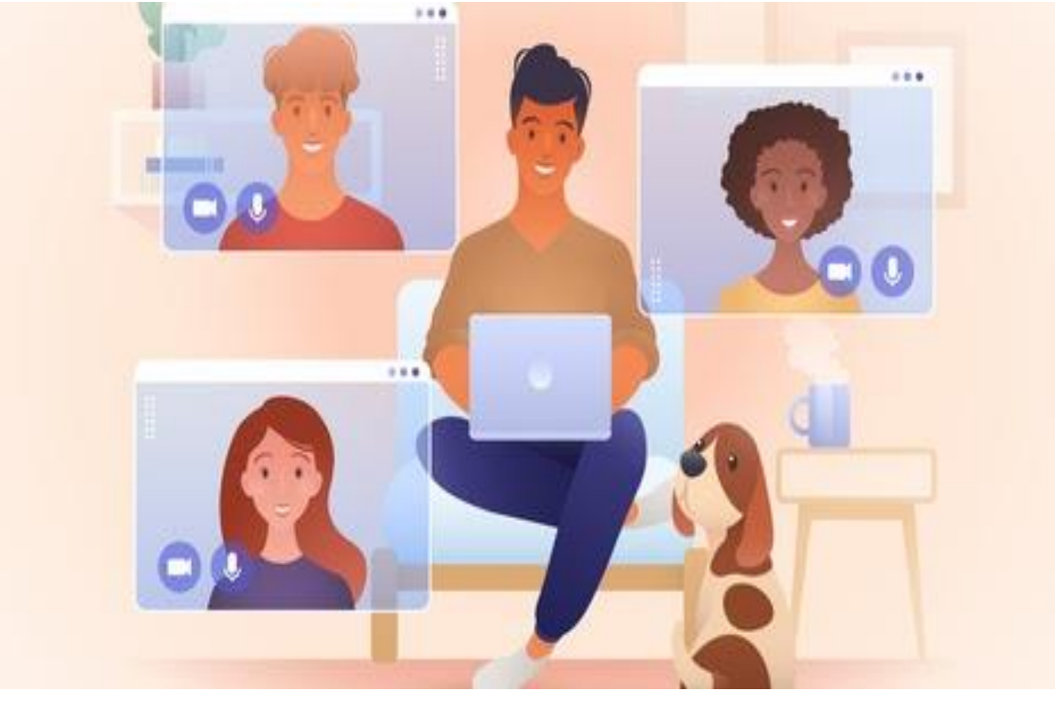
YOUTH WORKER ONLINE