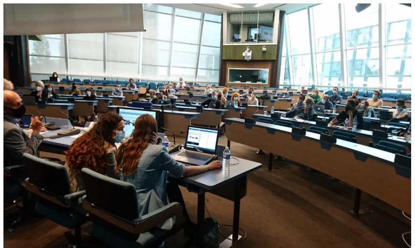
One of the workshops of the symposium at the Council of Europe, July 2021

A brainstorming session with the aim of creating a European network of DCR closed the symposium.