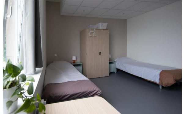
New accommodation at DCR Argos, Strasbourg, July 2021: one of the rooms @

The reflections focused on the evolution of DCR since the 2019 symposium. Then, in workshops, the participants discussed on: