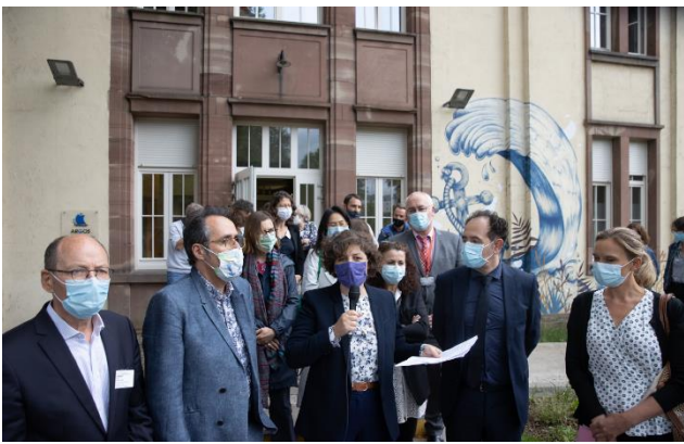
Inauguration of the DCR Argos accommodation as part of the symposium ; July 2021 @

On this occasion, Olivier Véran, France's Minister of Health and Solidarity, gave his support and congratulations to the City of Strasbourg for the work undertaken on harm reduction through the experimentation of the medical-social care and accommodation facility linked to the Argos DCR. This experiment was authorised by the Regional Health Agency in June 2021 and is a first in France.