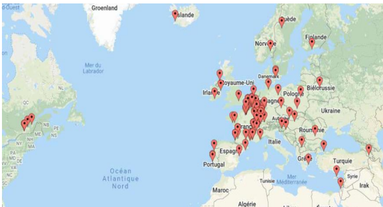
Worldwide geographical origin of registrants for the 1 st July 2021 symposium

Organised by the City of Strasbourg, the Pompidou Group of the Council of Europe, and the Ithaque association, manager of the Argos Drug Consumption Room in Strasbourg, in partnership with the Mildeca, the ARS Grand Est, the EFUS and the Correlation Network, this symposium brought together more than 300 participants from 33 different countries .