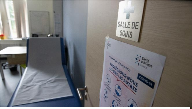
New accommodation at DCR Argos, Strasbourg, July 2021: treatment room @

On this occasion, Olivier Véran, France's Minister of Health and Solidarity, gave his support and congratulations to the City of Strasbourg for the work undertaken on harm reduction through the experimentation of the medical-social care and accommodation facility linked to the Argos DCR. This experiment was authorised by the Regional Health Agency in June 2021 and is a first in France.