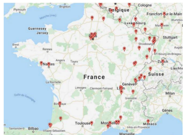
European geographical origin of registrants for the 1 st July 2021 symposium

"The presence of elected representatives from many French cities at the symposium in Strasbourg is a very positive sign, as is the work underway in Lille, where a DCR project was recently approved, in Marseille, where the project is ongoing, and in Paris, where the mayor has reiterated her request to open other low-risk drug consumption rooms on her territory" (Jeanne Barseghian, mayor of Strasbourg and Alexandre Feltz, deputy mayor of Strasbourg).