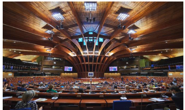
Plenary session of the symposium in the hemicycle of the Council of Europe, July 2021 @

On 1 st July 2021, the second European symposium on Drug consumption room (DCR) was held in Strasbourg, « Maintaining the momentum in the face of the major challenges of the 21st century », with the aim of sharing the wealth of experience , supporting existing rooms and contributing to the development of such harm reduction schemes in European countries. It is about being at the heart of issues that combine human rights, tranquillity, and public health.