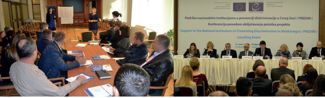
Cascade seminars in Moldova