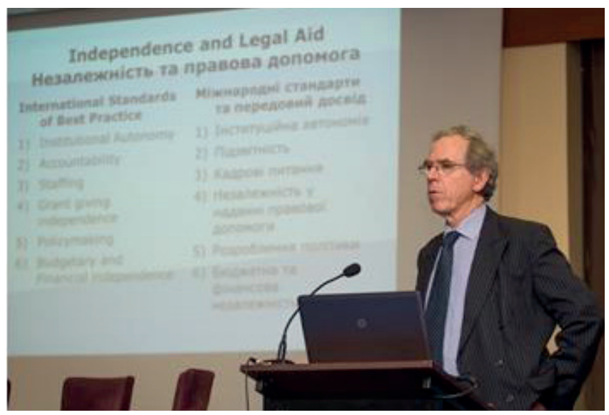
Presentation of the assessment of the Free Secondary Legal Aid System in Ukraine in the Light of Council of Europe Standards and Best Practices

IMPACT: In spring 2016 all 600 managers of the newly created local public prosecutor's offices received training organised by the Council of Europe under the project "Continued Support to the Criminal Justice Reform in Ukraine", jointly with the General Prosecutor's Office and the National Academy of Prosecutors of Ukraine, and with participation of other donors. New approaches towards knowledge management are being incorporated within the prosecutorial training system. The training programme focused on the application of the Criminal Procedure Code of Ukraine in the light of CoE standards, management and tools of decision-making, personnel management, effective communication, techniques for pressing charges in court and other aspects related to the operation of the prosecution service. Trainees, trainers and the National Academy staff all recognized the success and the importance of the said training activity.