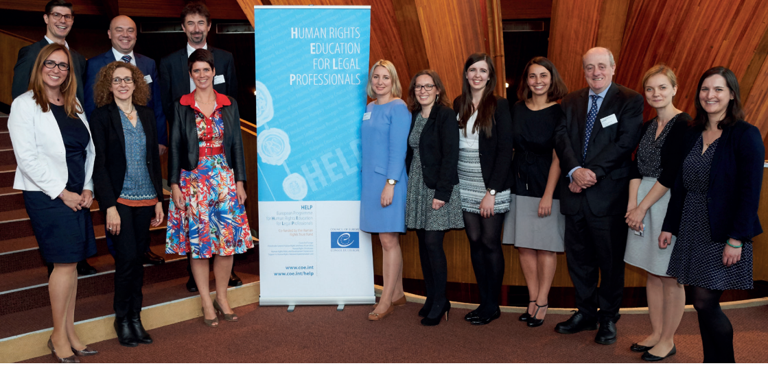
HELP Consultative board 2016

The catalogue of HELP courses was expanded with four new courses developed on the subjects of of data protection; the fight against racism, xenophobia and homophobia; labour rights; and personal integrity (bioethics). They are available for free on the HELP e-learning platform. HELP courses now extend beyond the Convention, also covering the European Social Charter and, increasingly since 2016, the EU Charter on Fundamental Rights and other relevant EU laws, as well as the case law of the Strasbourg Court and the Court of Justice of the European Union (CJEU).