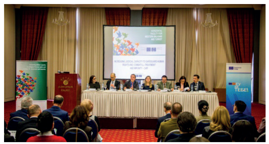
"The former Yugoslav Republic of Macedonia" Increasing judicial capacity to safeguard human rights and combat ill-treatment and impunity (CAPI)

In "the former Yugoslav Republic of Macedonia", a new EU/CoE Joint Project "Increasing judicial capacity to safeguard human rights and combat ill-treatment and impunity (CAPI) was launched in November 2016 under the WB – HF. A series of regional round tables to contribute to the harmonisation of judicial practice are foreseen.