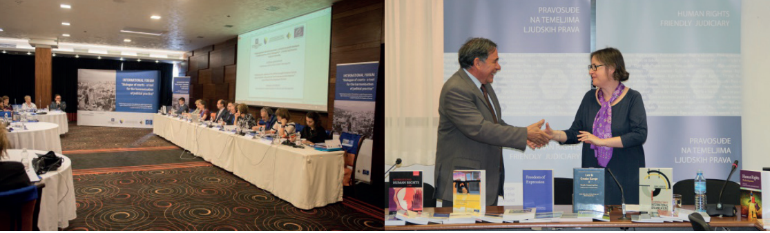
Bosnia and Herzegovina, International Forum "Dialogue of courts – a tool for the harmonisation of judicial practice"