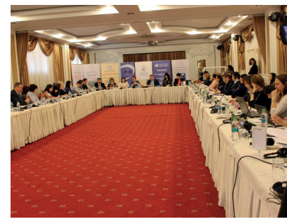
Ukraine presentation of the Ombudsman report

In Ukraine , to improve the way in which allegations into discrimination are handled, staff of the Ombudsperson's Office were trained on European anti-discrimination standards. Support in the field of data protection, where the Ombudsperson's role has increased, focused mainly on strengthening the existing legislation and capacities of the staff of the Ombudsperson and state institutions concerned. This was achieved though the EU/CoE joint project "Strengthening the European Human Rights Standards in Ukraine" under the Partnership for Good Governance.