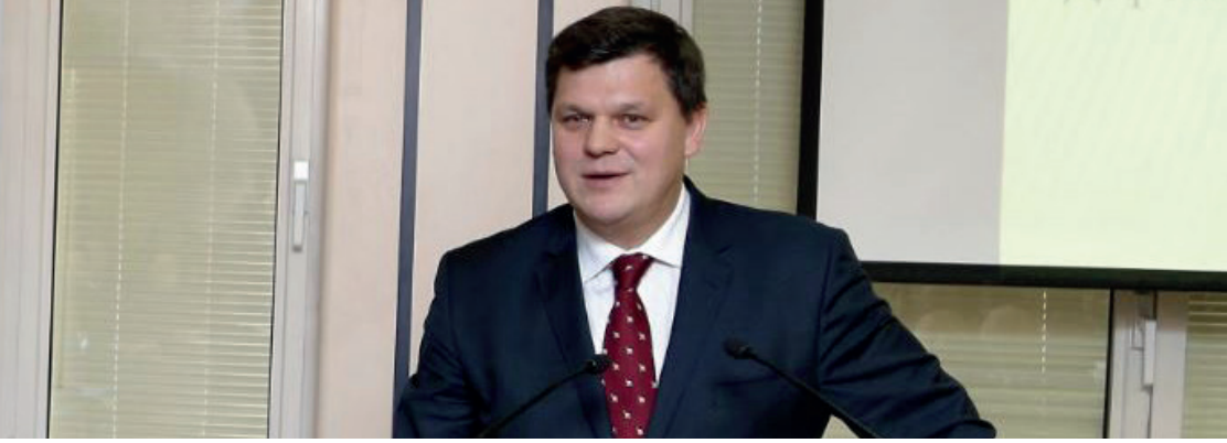
HELP in Russia Training of trainers activity

Criteria in applications submitted to the Strasbourg Court, Asylum and the Convention, Family Law and Child Friendly Justice, Business and Human Rights. One course – on Admissibility of Evidence in Criminal Cases – was developed.