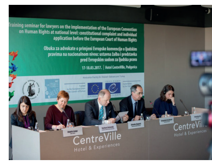
Montenegro, "Fighting ill-treatment and impunity and enhancing the application of the ECtHR case law on national level" (FILL)

This endeavour has been undertaken under the Project "Fighting ill-treatment and impunity and enhancing the application of the ECtHR case law on national level" (FILL) launched in September 2016 under the "Western Balkans Horizontal Facility" (WB – HF).