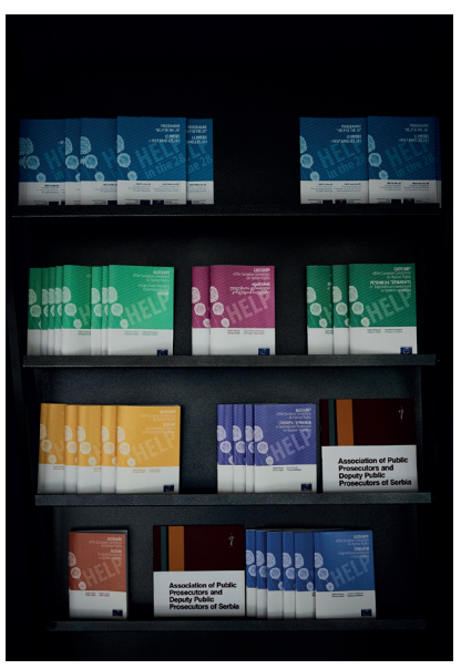
Glossaries of the European Convention of Human Rights

The glossary developed by the Division aims to guide legal professionals from Council of Europe member states in using the correct terminology when they make Convention-based arguments in national proceedings and to develop a full understanding when reading judgments in English. In 2016, the following linguistic versions were available: Albanian, Armenian, Azerbaijani, Bulgarian, Bosnian, Georgian, Romanian, Russian, Serbian and Ukrainian.