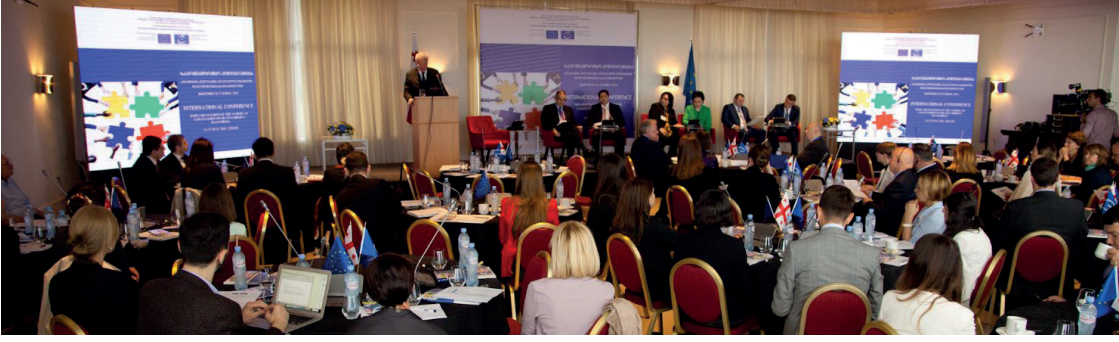
Georgia, "Application of the European Convention on Human Rights and harmonisation of national legislation and judicial practice in line with European standards"

IMPACT: In its Judgment Cupara v. Serbia (34683/08), the Strasbourg Court found no violation of Article 6 because national legislation in Serbia, reformed with the support of the Council of Europe, provided for "machinery capable for overcoming... inconsistencies [in judicial practice], namely referring to the action plan aimed at ensuring the general harmonisation of case-law throughout the Serbian judicial system adopted by the Supreme Court of Cassation in April 2014".