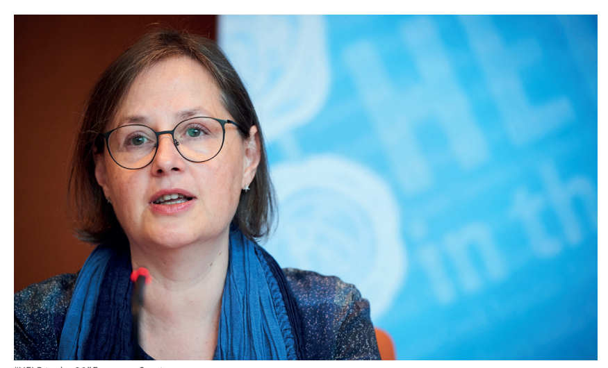
"HELP in the 28" European Seminar

Partnership with European alliances, such as the Council of Bars and Law Societies of Europe (CCBE) and the European Judicial Training Network (EJTN) has been an asset for the project. In the case of EJTN, complementarities reinforce each institution's impact. While EJTN exclusively focuses on (mainly traditional) training of judges and prosecutors in the 28 EU member states and in nearly all branches of law, HELP in the 28 focuses on e-learning of judges, prosecutors and lawyers in the specialised field of human rights. The creation of an EJTN sub-working group on human rights is seen by HELP as a timely and powerful means of optimising HELP resources.