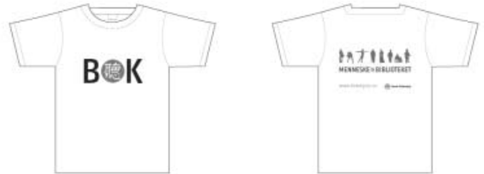
Book t-shirts of the Living Library in Alvarn Ungdomskole