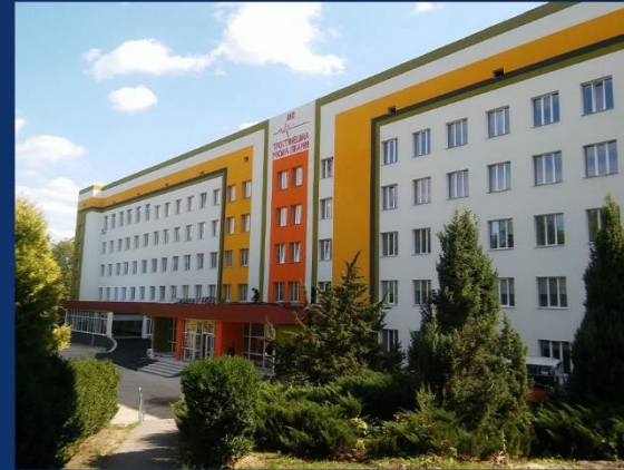
Trostyanetska central district hospital