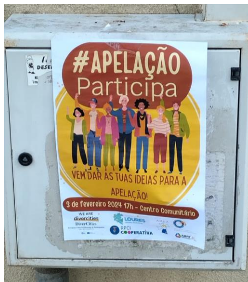
Poster inviting for the Assembly