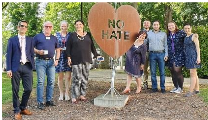
Participants in the 3 rd drafting group meeting.