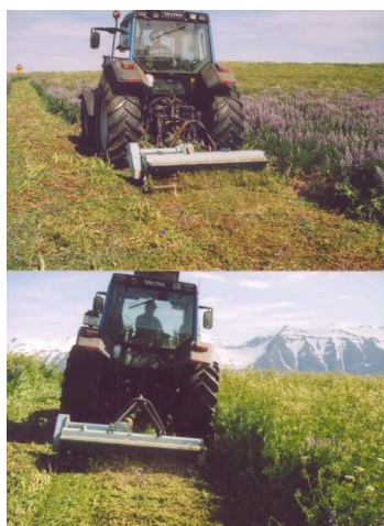
Fig 1. Mechanical cutting of stands of Nootka lupine (above) and cow parsley (below) in Hrisey-island, northern Iceland in 2007.

The Nootka lupine ( Lupinus nootkatensis ) and cow parsley ( Anthriscus sylvestris ) are two of the worst alien plant species in Iceland. There are currently two projects focusing on these species: a) control of Nootka lupine in the Skafafell National Park, southern Iceland, by sheep grazing and mechanical cutting, b) control of lupine and cow parsley in Hrisey-island, northern Iceland, by mechanical cutting and herbicide treatment (Fig 1).