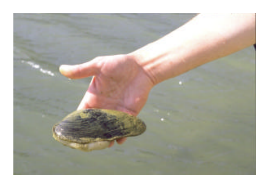
Figure 1. Spanish specimen of M. auricularia

Margaritifera auricularia is a very big naiad, maximum length 20 cm, with a black periostracum and flattened umbones (Figure 1). The two valves are equal, shortened in the anterior part and elongated posteriorly. Growth lines are marked in the shell (and the periostracum) although near the shell edge many lines are together, making it impossible to make a realistic estimation of age based on these external marks.