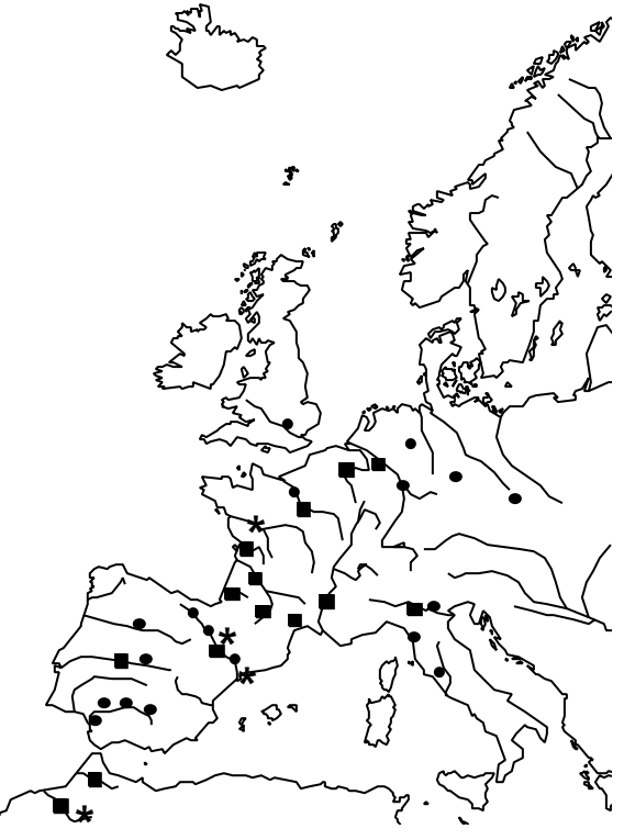
Figure 2. Fossil (dots), historical (squares) and current (asterisks) distributions of M. auricularia .

Based on standard mark-release-recapture methods, the known population in the Canal Imperial has been estimated at about 2,000 specimens (Araujo & Ramos, 2000a, b) although a complete survey of the channel is pending. Recent information has been published on the presence of M. auricularia in the middle section of the River Ebro (Álvarez, 1998a, b), where the authors of this report have found one living specimen in July 2000. Nevertheless, there is not enough information to ascertain if there are isolated specimens or viable populations in this river section until more deep sampling has been carried out.