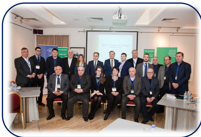
Mayors, leaders for change workshop, 23-25 February 2016