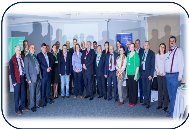
Mayors, leaders for change workshop , 9-11 March 2016