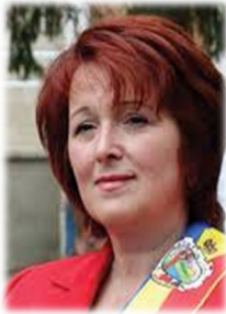
President Deputy Head of the Moldovan Delegation to the Congress