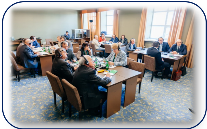
Mayors, leaders for change workshop, 29-30 March 2016