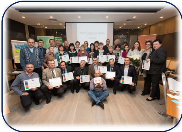
Mayors, leaders for change workshop , 2-4 February 2016