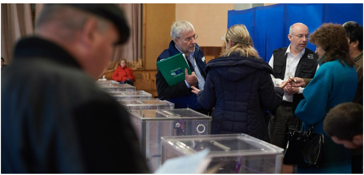
Photo: Observation mission of local and regional elections in Ukraine on 25 October 2015

The Congress of Local and Regional Authorities has been taking part in the observer missions for local elections in the 47 Council of Europe member countries and beyond since 1990. The observer missions are conducted at the official request of the national authorities concerned and complement the political monitoring of the European Charter of Local Self-Government.