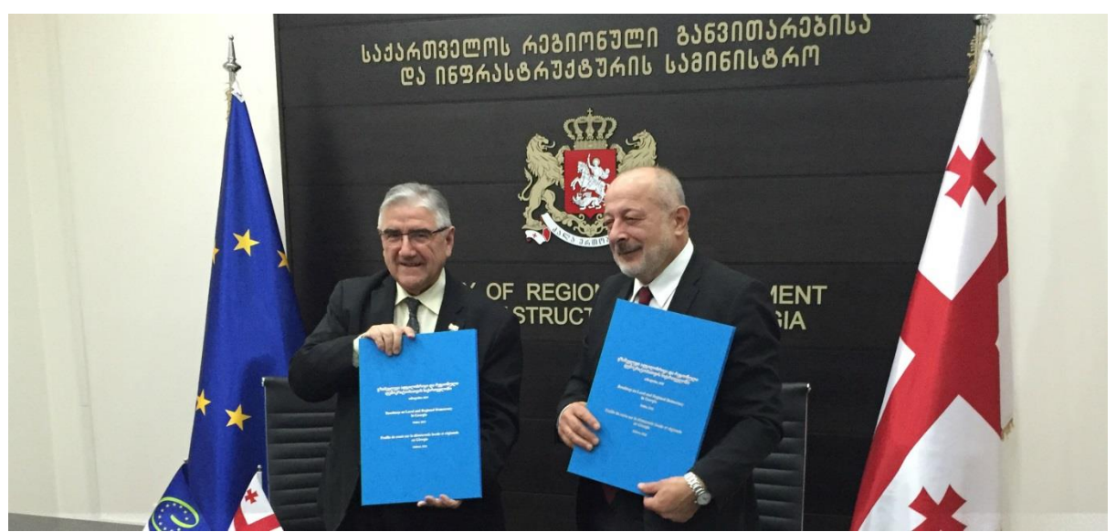
Photo: The President of the Congress and the President of Georgia, Giorgi Margvelashvili, at the signature of the roadmap, on 16 December 2015

The Post-monitoring is a procedure established by the Congress to ensure a follow up to the implementation of its recommendations to member states on local and regional democracy, through enhanced political dialogue between the authorities of the state concerned and the Congress. The procedure is initiated at the request of a state's authorities. It is essentially based on political dialogue with the Congress and only concerns the recommendations adopted by the Congress with regard to the countries that have accepted the post-monitoring.