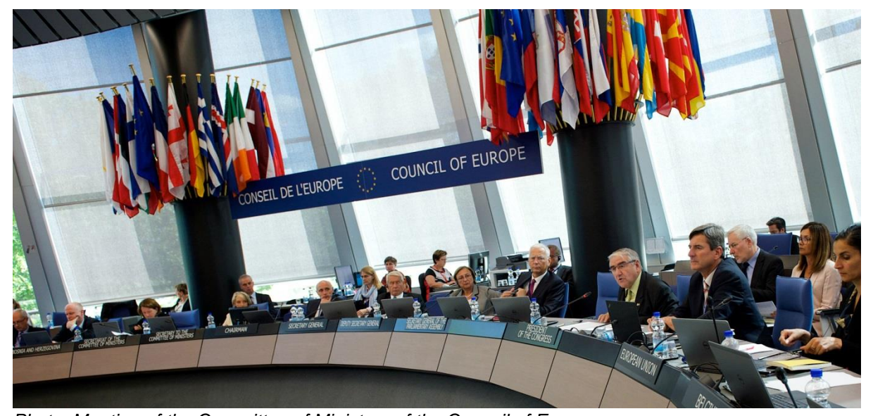
Photo: Meeting of the Committee of Ministers of the Council of Europe