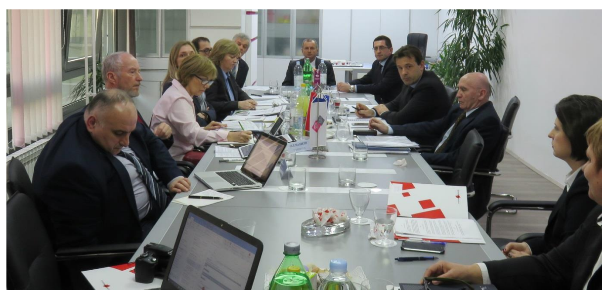
Photo: Monitoring visit in Republic of Croatia, from 2 to 4 March 2016

The core mission of the Congress of Local and Regional Authorities is the effective monitoring of the situation of local and regional democracy in member states by assessing the application of the European Charter of Local Self-Government, adopted in 1985.