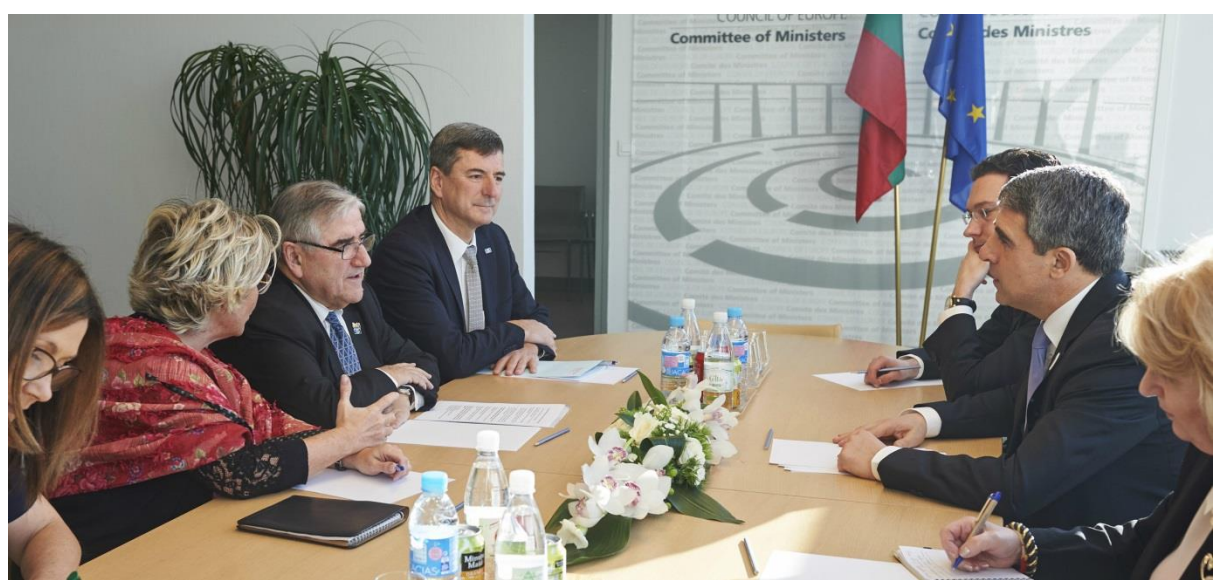
Photo: The President of the Congress and the President of Bulgaria, Rosen Plevneliev, on 26 January 2016

The Congress contributed actively to several events organised by the presidency of Bulgaria of the Committee of Ministers.