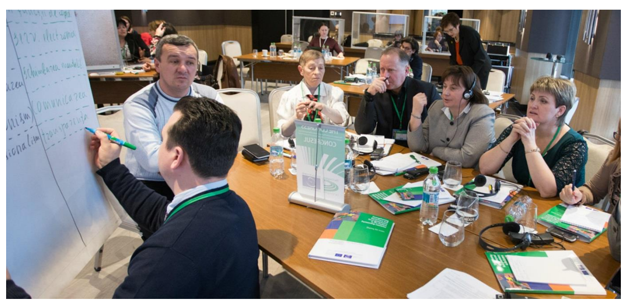
Photo: Workshop "Mayors, leaders for change", in Republic of Moldova from 2 to 4 February 2016

The aim of the Congress' co-operation activities is to assist a number of member states in implementing the recommendations adopted by the Congress to provide a practical response to the problems identified in the course of monitoring and post-monitoring activities and the observation of elections and based.