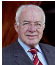
Herwig van Staa (ÖVP) Congress President of the Regional Council of Tyrol European People's Party