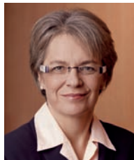
Petra Bohuslav (ÖVP) Minister of the Regional Government in Lower Austria European People's Party