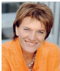
Christine Oppitz-Plörer (ÖVP) Mayor of Innsbruck European People's Party