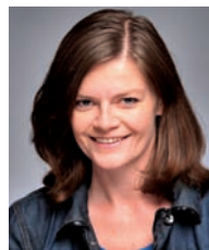
Sybille Straubinger (SPÖ) Councillor of Local and Regional Council of Vienna Socialist Group