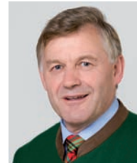
Franz Leonhard EBI National Council (ÖVP) European People's Party Salzburg