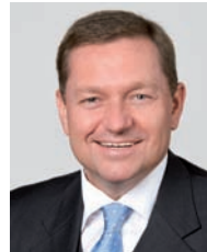
Werner Amon National Council (ÖVP) European People's Party Styria