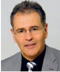
Edgar Mayer Federal Council (ÖVP) European People's Party Vorarlberg