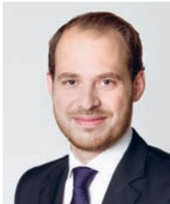
Nikolaus Scherak National Council (NEOS) Non-affiliated Lower Austria