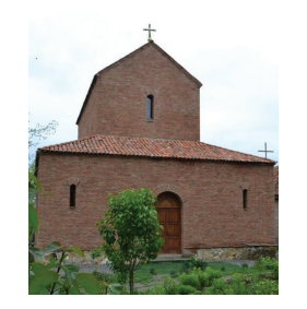
Church of the Thirteen Assyrian Fathers in Dzveli Kanda-Georgstal