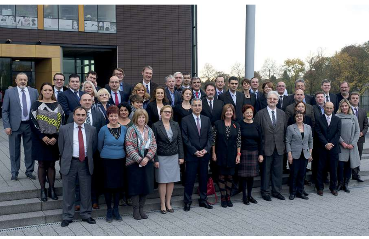
Some members of the CPT do not appear in this photograph.