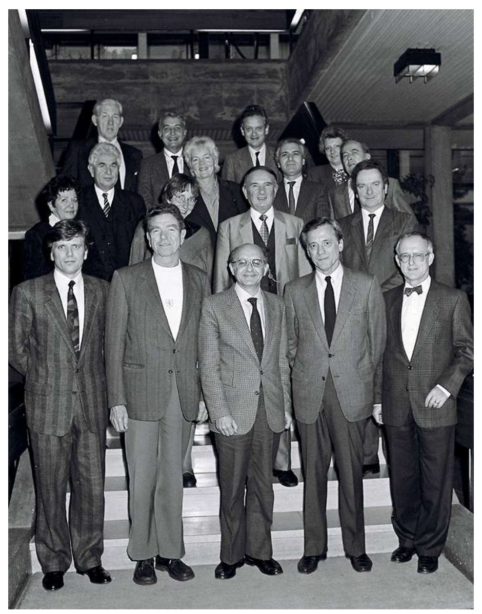
Photograph taken on the occasion of the CPT's first plenary meeting (November 1989)