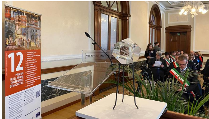
ELoGE Ceremony Italy

CEGG has supported implementation of ELoGE in Italy, in cooperation with the accredited body AICCRE (L'Associazione italiana per il Consiglio dei Comuni e delle Regioni d'Europa), the Italian chapter of the Council of European Municipalities and Regions (CEMR). 39 municipalities were awarded with the Label, a record number which is a testament to the high interest this experience raised among Italian local governments, and to the commitment of the participating ones in concluding the process.