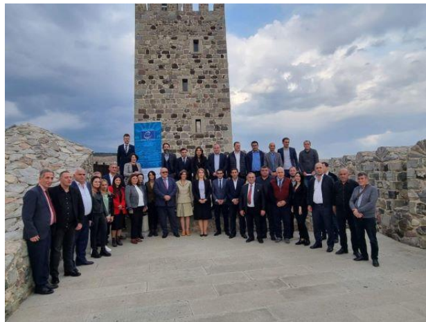
Leadership for Cross-border Cooperation, Stage 2, Georgia

Following the launch of the Leadership Academy Programme for Cross-border cooperation in Armenia in May 2022, the 2 nd Stage of the LAP for CBC was held in Akhaltsike, Georgia 17-19 October 2022. Participants examined the legal framework for cross-border cooperation and identified potential ratification of Protocol No. 3 to the Madrid Outline Convention on Cross-border cooperation as a possible solution to launching cross-border cooperation arrangements.