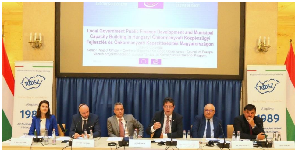
Launching Conference of the project in Budapest

A new project " Local Government Public Finance Development and Municipal Capacity Building In Hungary ", co-funded by the Council of Europe and the European Union, was launched in September 2022. It was developed in close cooperation with the main beneficiary, the Hungarian National Association of Local Authorities (TÖOSZ) and aims to strengthen the administrative and financial capacity of the municipalities in Hungary.