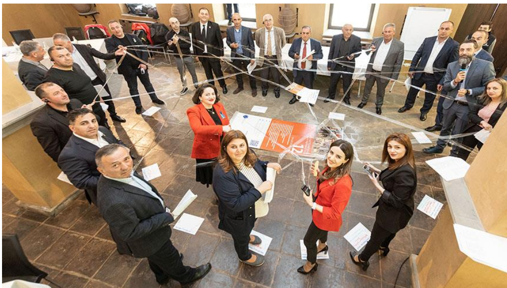
Leadership for Cross-border Cooperation, Stage 1, Armenia

A Leadership Academy for Cross-Border Cooperation (LAP for CBC) was launched in 2022, with the aim to breaking down barriers, overcoming obstacles, building friendship, and promoting a common vision for a shared space among Mayors and senior local officials from Armenia and Georgia. The first stage of the LAP for CBC offered about 25 representatives from bordering Armenian and Georgian municipalities the opportunity to develop ideas for cooperation based on culture, heritage, and technological cooperation. The second stage examined the current legal framework in both jurisdictions, helped develop capacities and defined possible measures to overcome obstacles to cross-border cooperation. The first stage of the LAP for CBC was organised in May in Armenia (Dzoraget, Lori region), while the second one in October in Georgia (Akhaltsikhe, Samtskhe–Javakheti region).