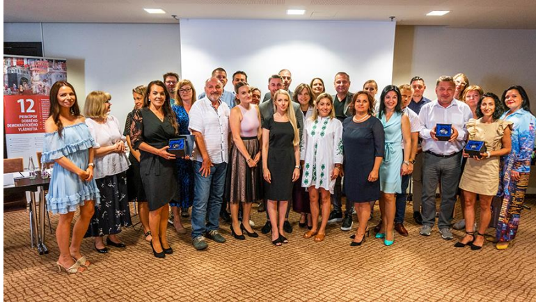
2 nd round of ELoGE in Slovakia – Awards ceremony

democratic governance and the most relevant European practice. In addition to the policy recommendations, CEGG has simultaneously implemented different capacity-building tools for the local authorities, in cooperation with several local partner organisations. The tools touch upon areas such as: Strategic Municipal Planning , Public Ethics Benchmarking , Local Finance Benchmarking , preparation of different national training programmes and implementation of the second round of ELoGE in the country.