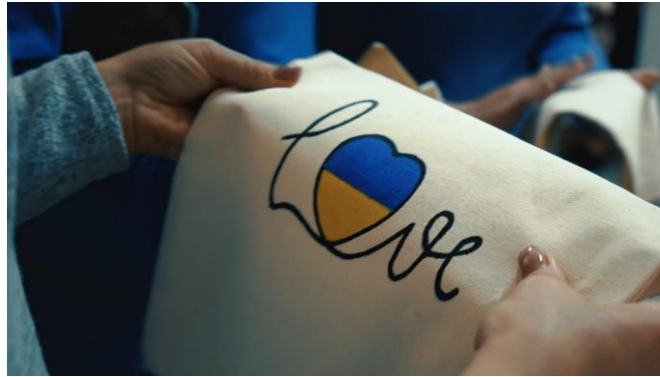
Horodok community, Khmelnytskyi region)

Irrespective of the permanently changing and volatile context, the CEGG remains a valued advisor to the Government, the Parliament, and local authorities in Ukraine on standards and values in respect of good democratic governance.