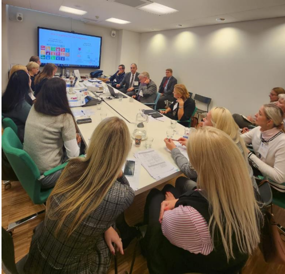
Study visit in Finland

The regional dimension of the study visit raised interest and brought benefit to the host authorities as well - as confirmed by the Finnish counterparts.