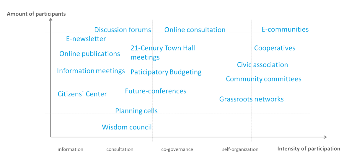
The table 1: Spectrum of information and public participation procedures today

The y-axis of this graph shows the amount of participants that participatory methods and formats (from 10 people to several thousands) can include, whereas the x-axis displays the intensity of involvement (from just information, consultation to co-and self-governance) (cf. OECD 2003:32). Between these two axes there are different methods, formats, and organisational types mapped which are only a cursory selection of examples and not a comprehensive overview. In addition we included also types of self-organized participation, which are clearly dialogue-based but miss the direct link to political decision-making in a polity.