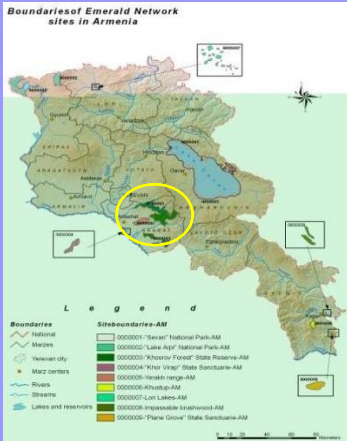
Boundaries of Emerald Network sites in Armenia