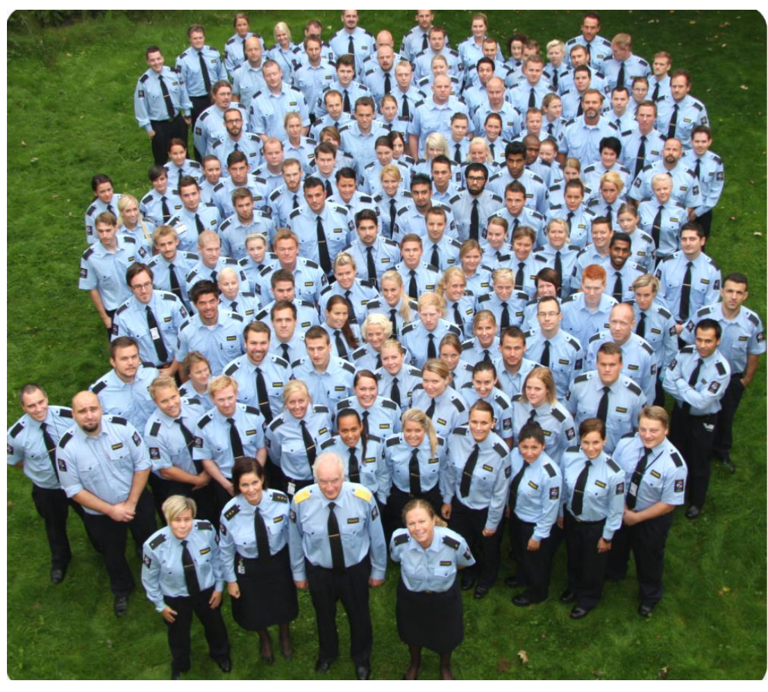
Class of 2012