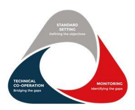
Figure 1: Council of Europe strategic triangle