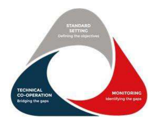
Figure 1: Council of Europe strategic triangle

Council of Europe technical assistance programmes form an integral part of the unique strategic triangle of standard-setting, monitoring and co-operation: the development of legally binding standards is linked to their monitoring by independent mechanisms and supplemented by technical co-operation to facilitate their implementation. The Council of Europe's actions are developed and implemented in areas where the Council of Europe has strong expertise and added value.