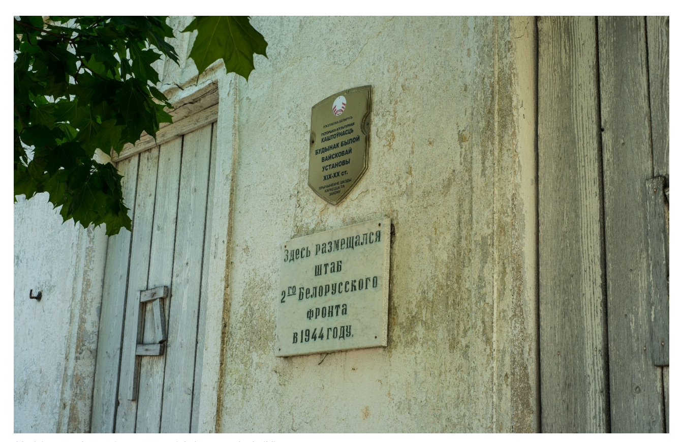
Mscislaŭ. Hotel "Hermitage". Memorial plaque on the building