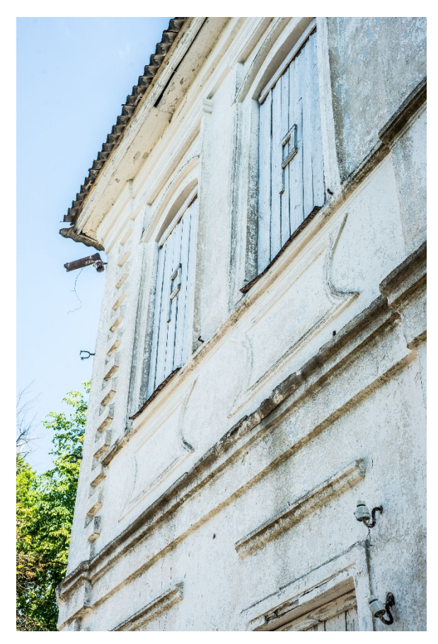
Mscislaŭ Hotel "Hermitage". Fragment of main facade