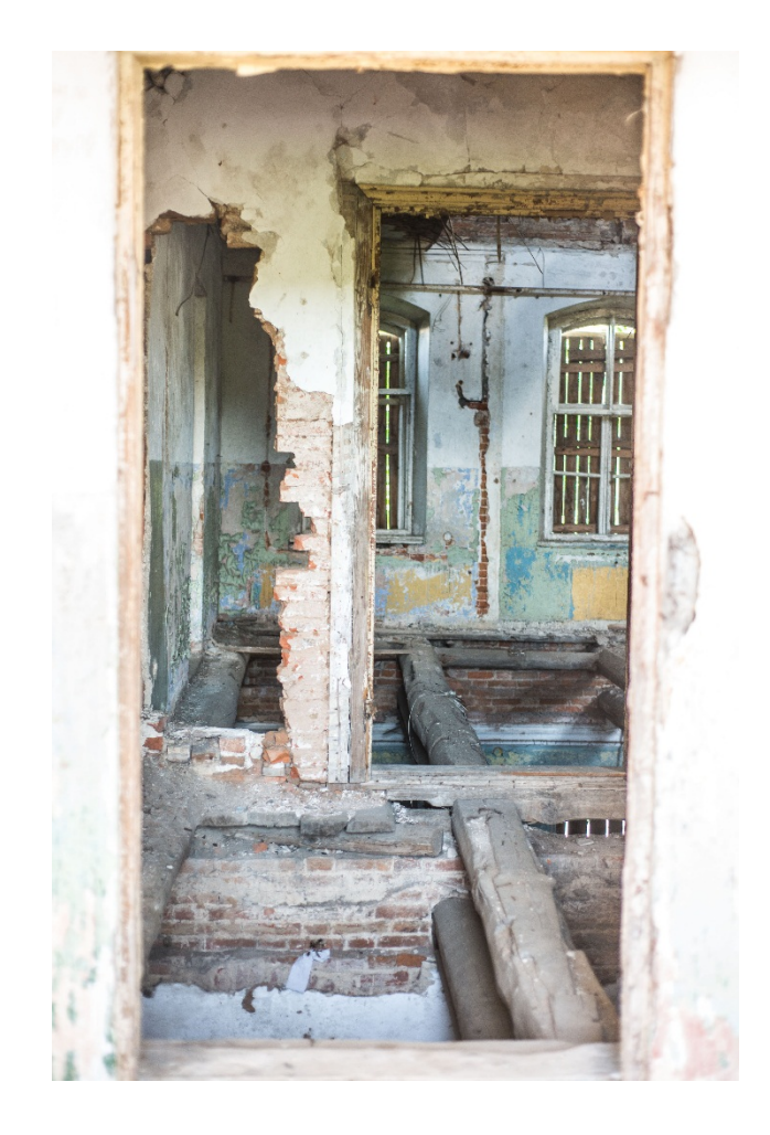
Mscislaŭ Hotel "Hermitage". Inside view