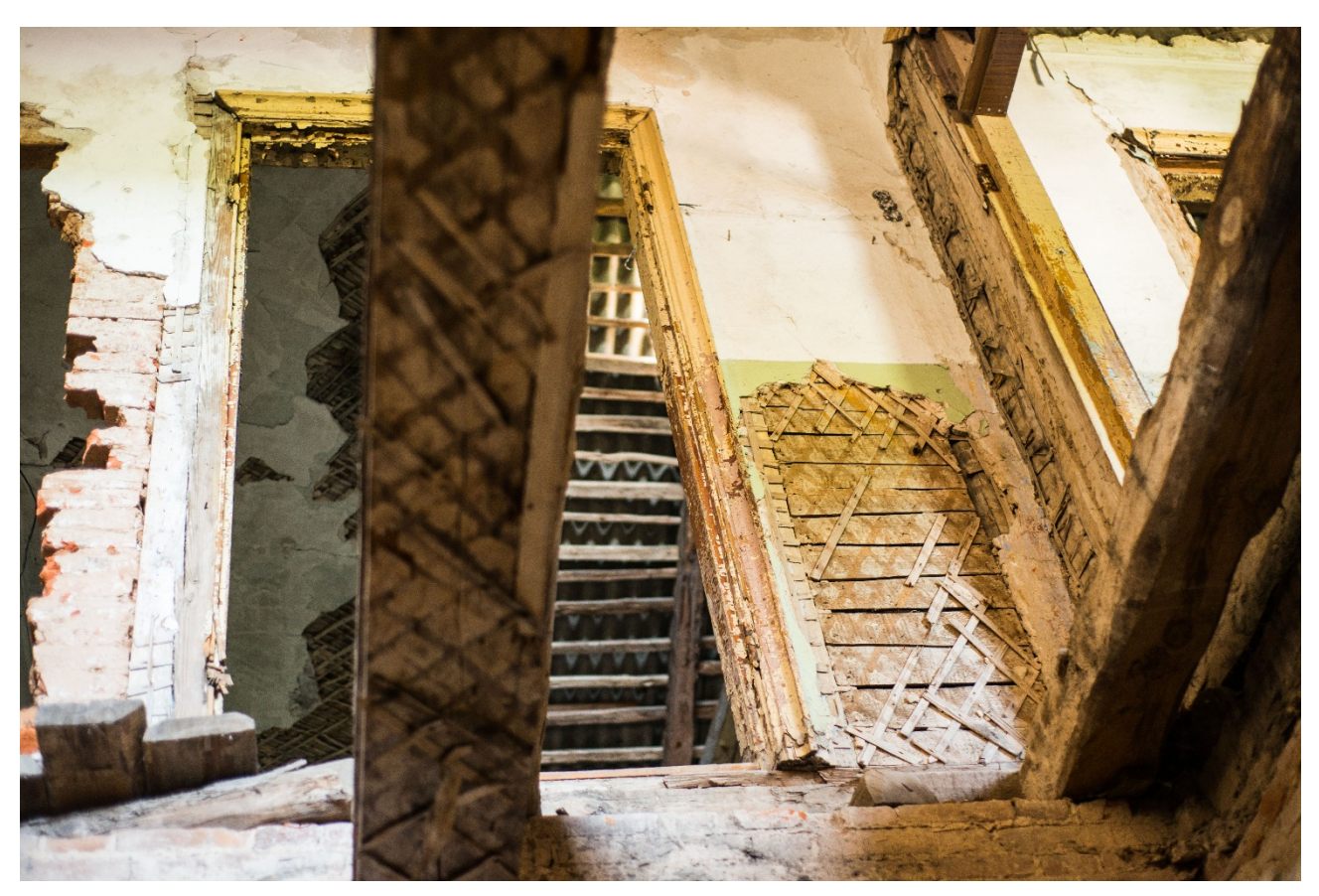
Mscislaŭ Hotel "Hermitage". Inside view