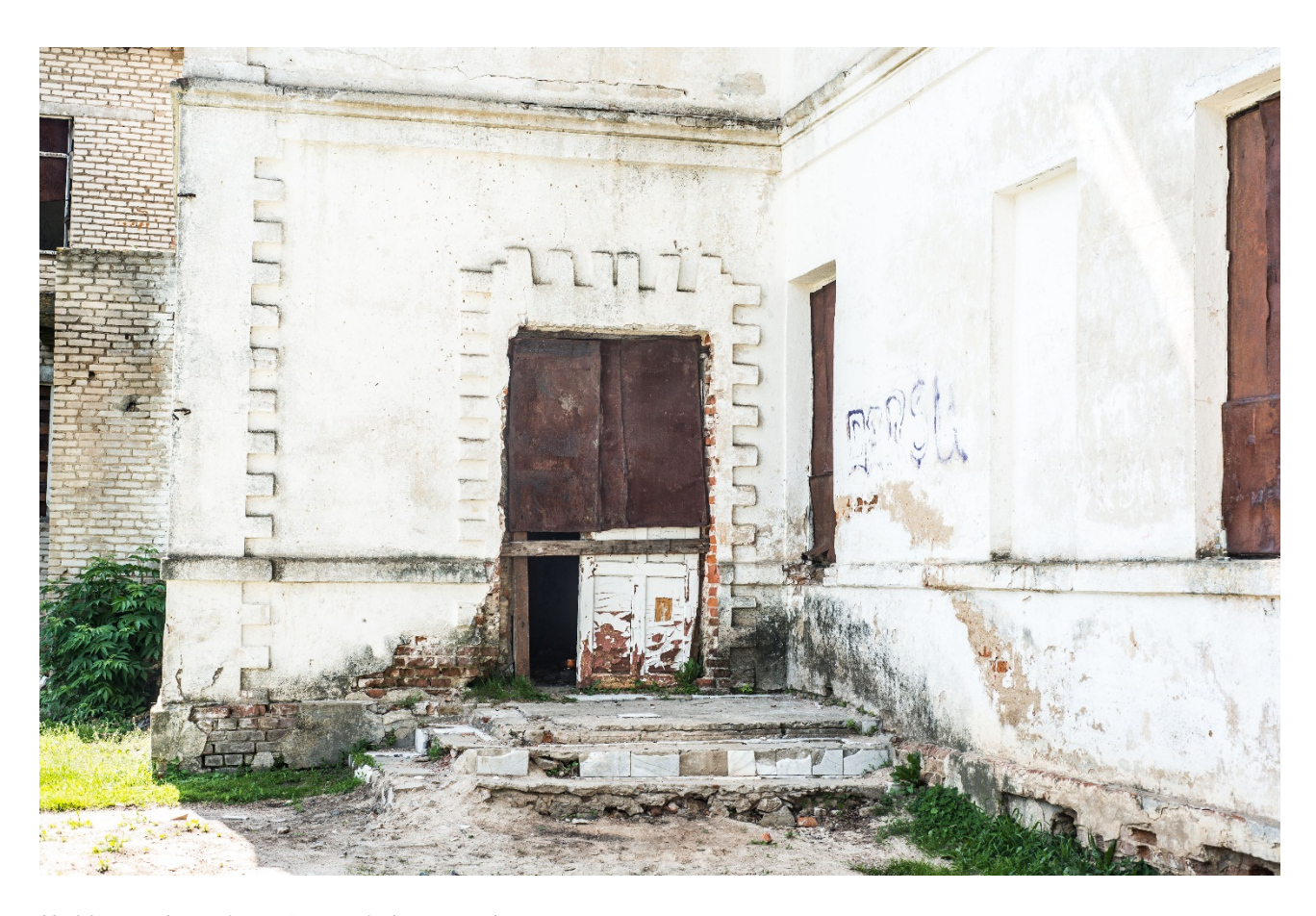
Mscislaŭ Hotel "Hermitage". Entrance in the courtyard