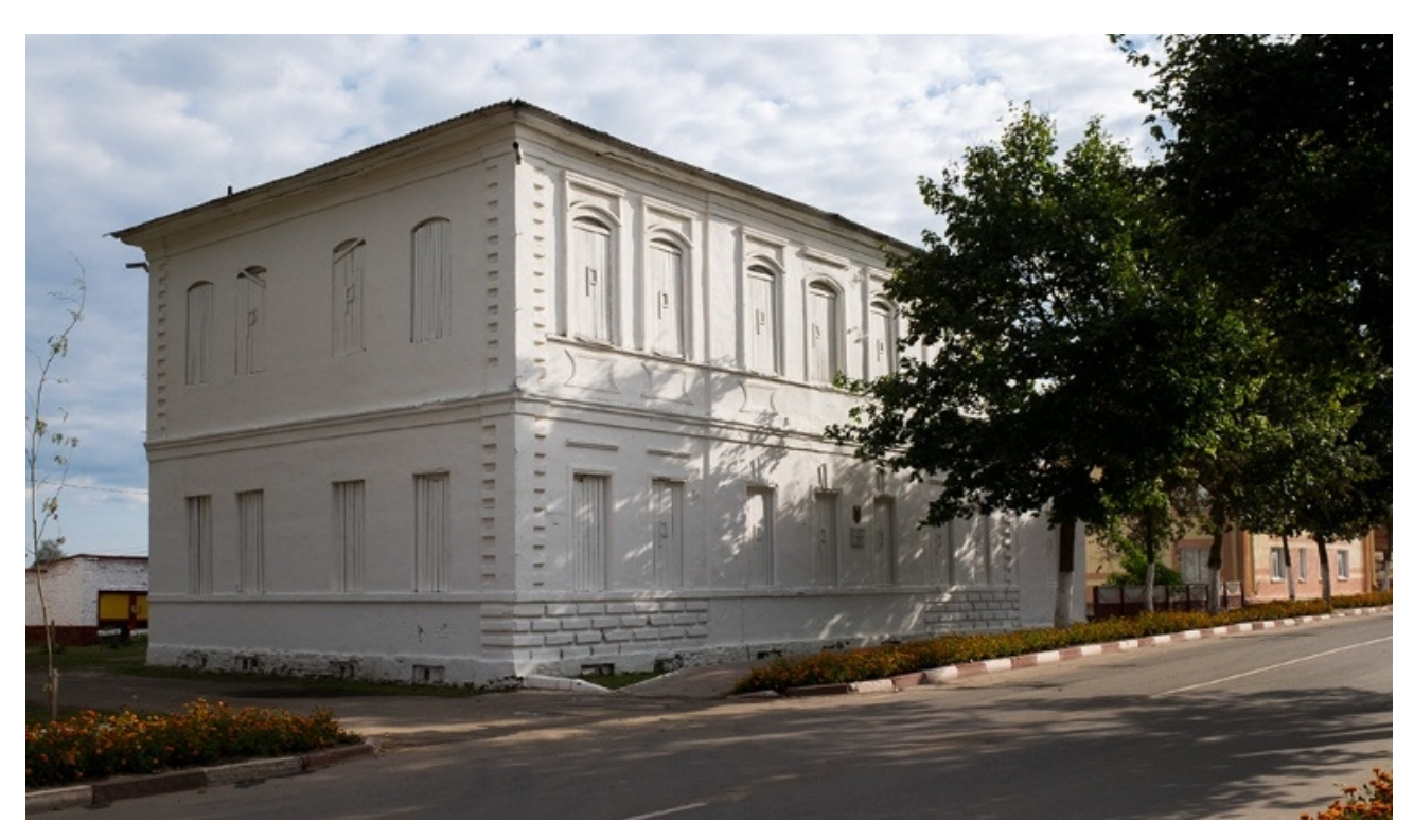
Mscislaŭ Hotel "Hermitage". View from Proletarian Str.