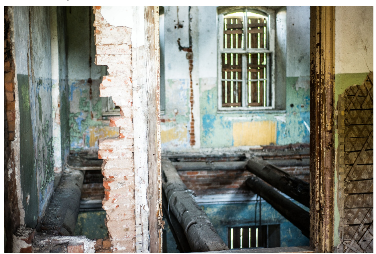
Mscislaŭ Hotel "Hermitage". Inside view