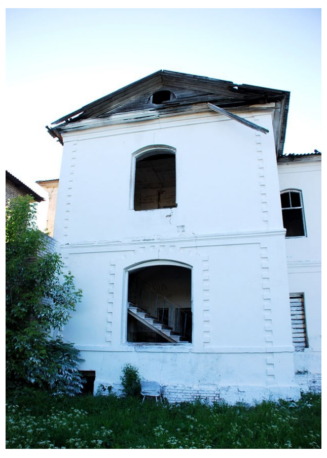
Mscislaŭ Hotel "Hermitage". View inside, from the courtyard