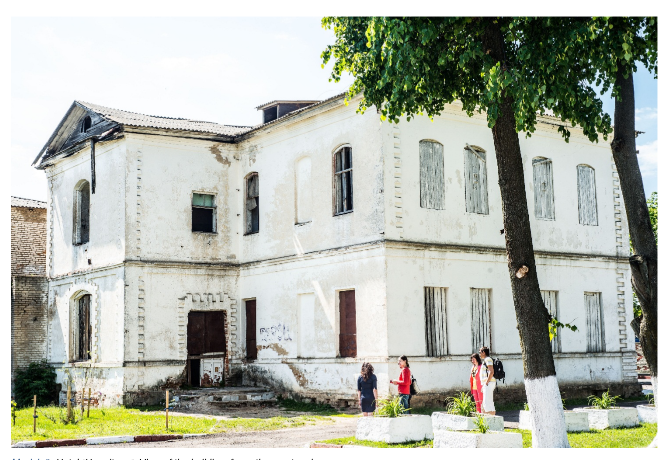
Mscislaŭ Hotel "Hermitage". View of the building from the courtyard