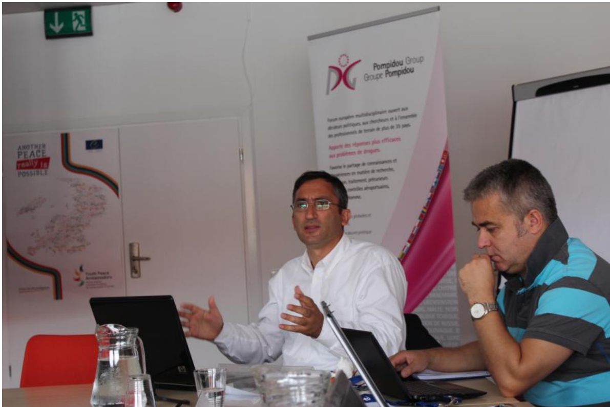
Photo: Researcher discussing his report in Budapest, 15 September 2014