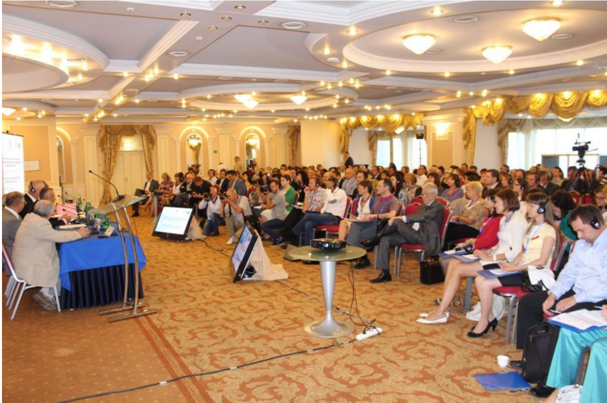
Photo: International Conference on Reducing the Demand for Drugs, 11-12 September 2014