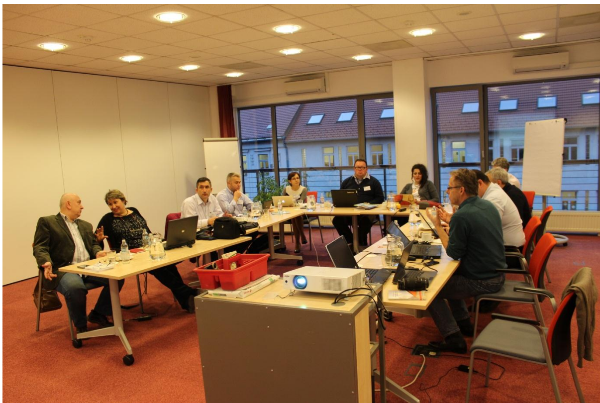
Photo: First meeting with the 10 researchers in Budapest, 19 February 2014