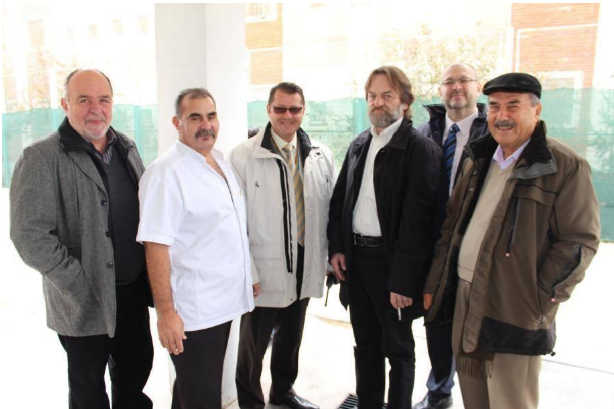
Photo: Serbian delegation meeting with prison staff

A Serbian delegation consisting of high-level representatives of the Ministry of Health and Ministry of Justice visited Bucharest in order to study Therapeutic Communities in Romanian prisons. A project manager of the Pompidou Group accompanied the delegation. During the three-day study visit (4-6 November 2014) they met the Head of the Romanian Prison Administration as well as prison doctors, heads of security and therapists. At the introductory workshop on the first day of the visit, the Romanian hosts gave an overview of their health services in prisons and presented the theory and praxis of drug treatment services in prisons. The Romanian and Serbian counterparts also talked about the different national practices and specificities of their prison systems. On the second and third day the delegation visited Rahova and Jilava Prisons where they interviewed members of the TCs and prison staff involved in the day-to-day work with the recovering inmates. After the visit, the Serbian delegation confirmed their interest in replicating the Romanian experience in their prisons. Moreover, the Romanian Prison Administration agreed to support TC implementation in Serbia and in the Republic of Moldova. The study visit was organised on an initiative of the Pompidou Group and financed through the TAIEX instrument of the European Union. The Pompidou Group will wait for the decision of the Serbian Ministries on whether they want to adopt the Romanian model.