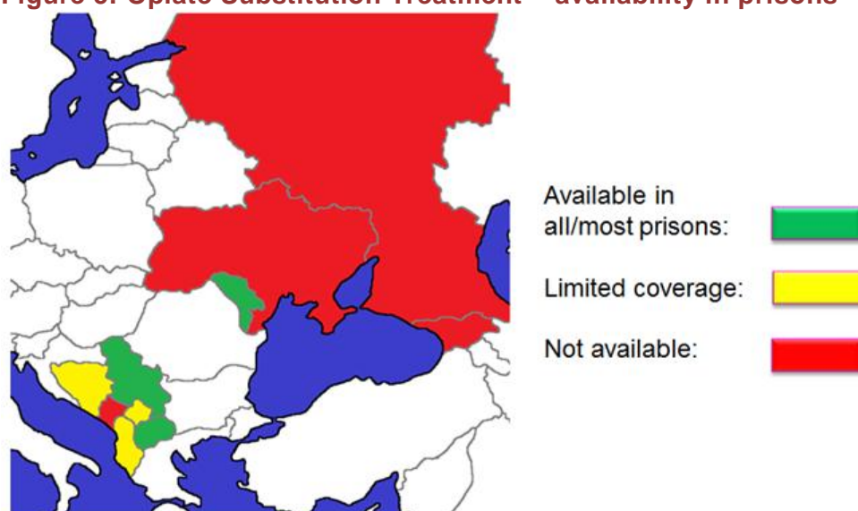
Figure 6: Overview of relevant prison data: