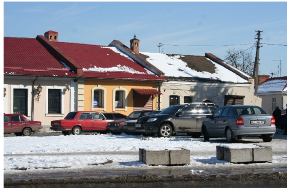
Traffic problems in Old Town