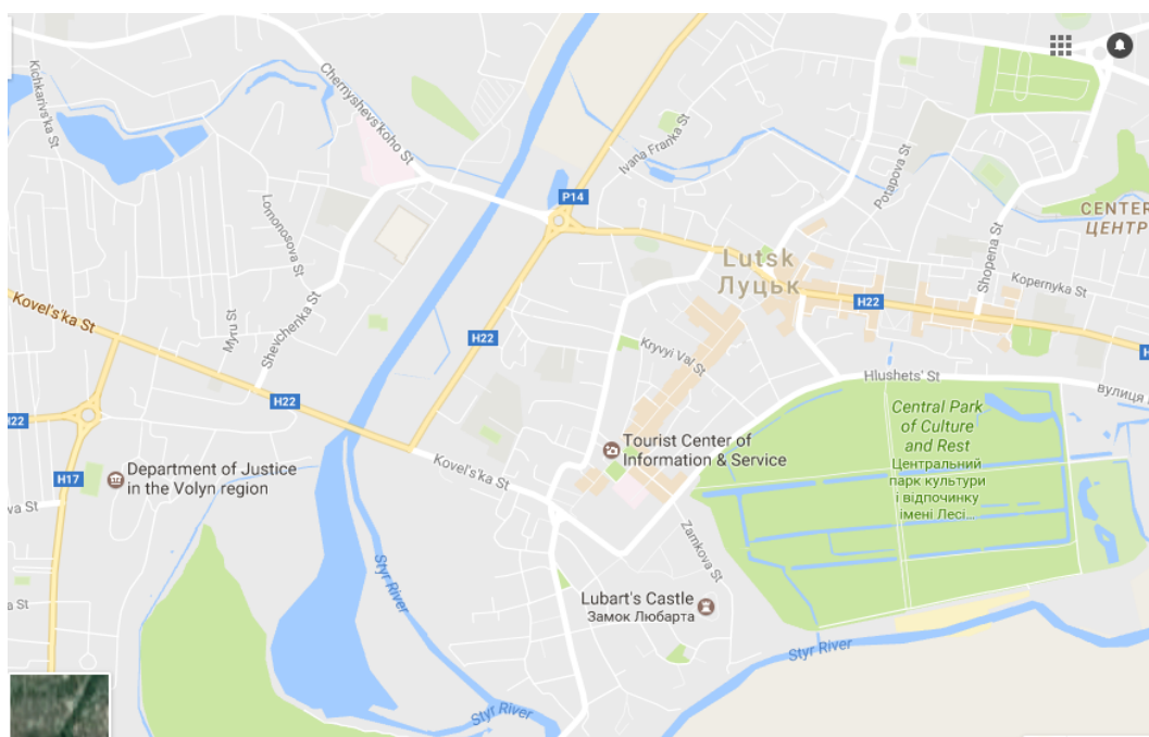
Road map in Old Town