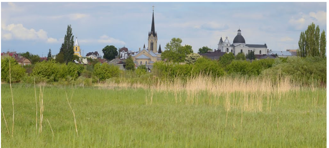
Old town temples. View from Hnidawa Swamp