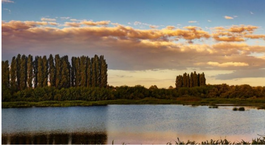
Site location near Lutsk