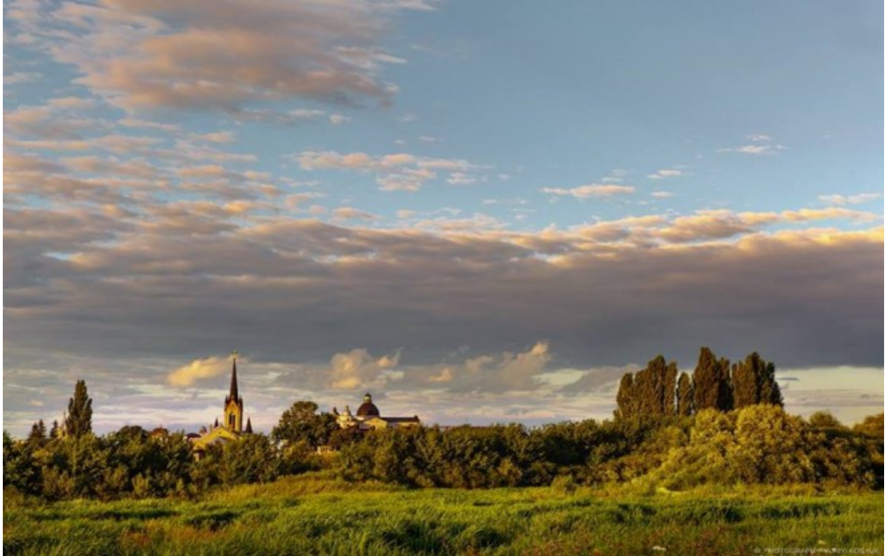
View of the Lutheran Church and Church of the Holy Apostles Peter and Paul