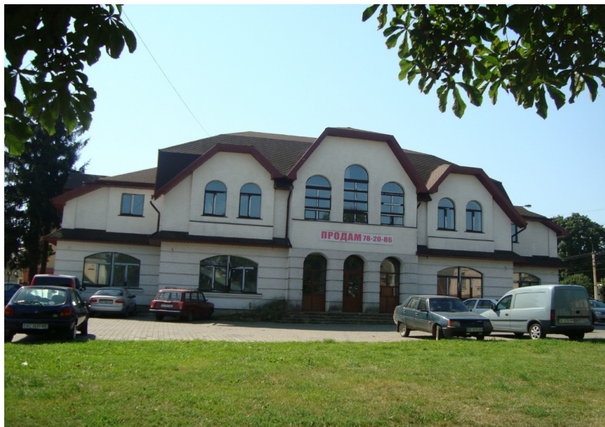
Building, located on the place of old Town Hall