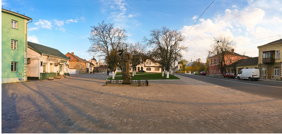
Building on the site of the former Town Hall at the top of the modern Market Square in Lutsk