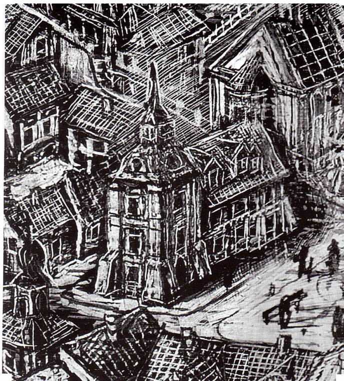
Reconstruction of Lutsk Town Hall