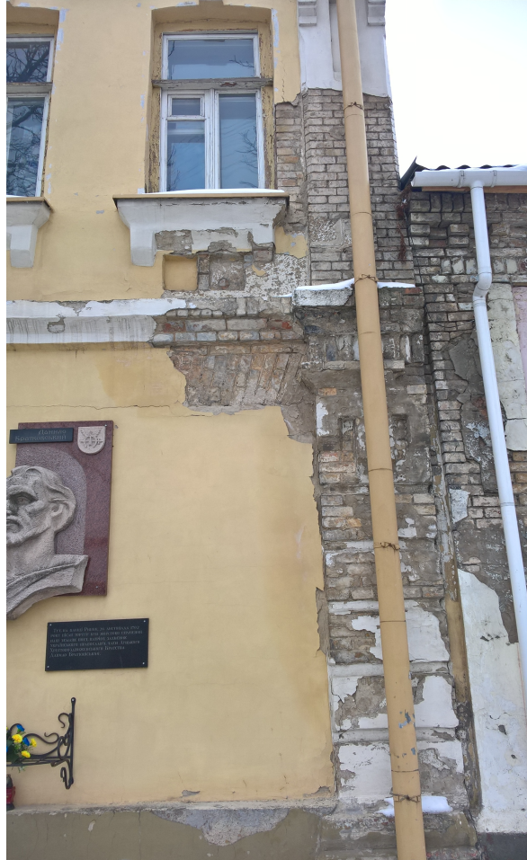
The facade of the future City Cultural Centre