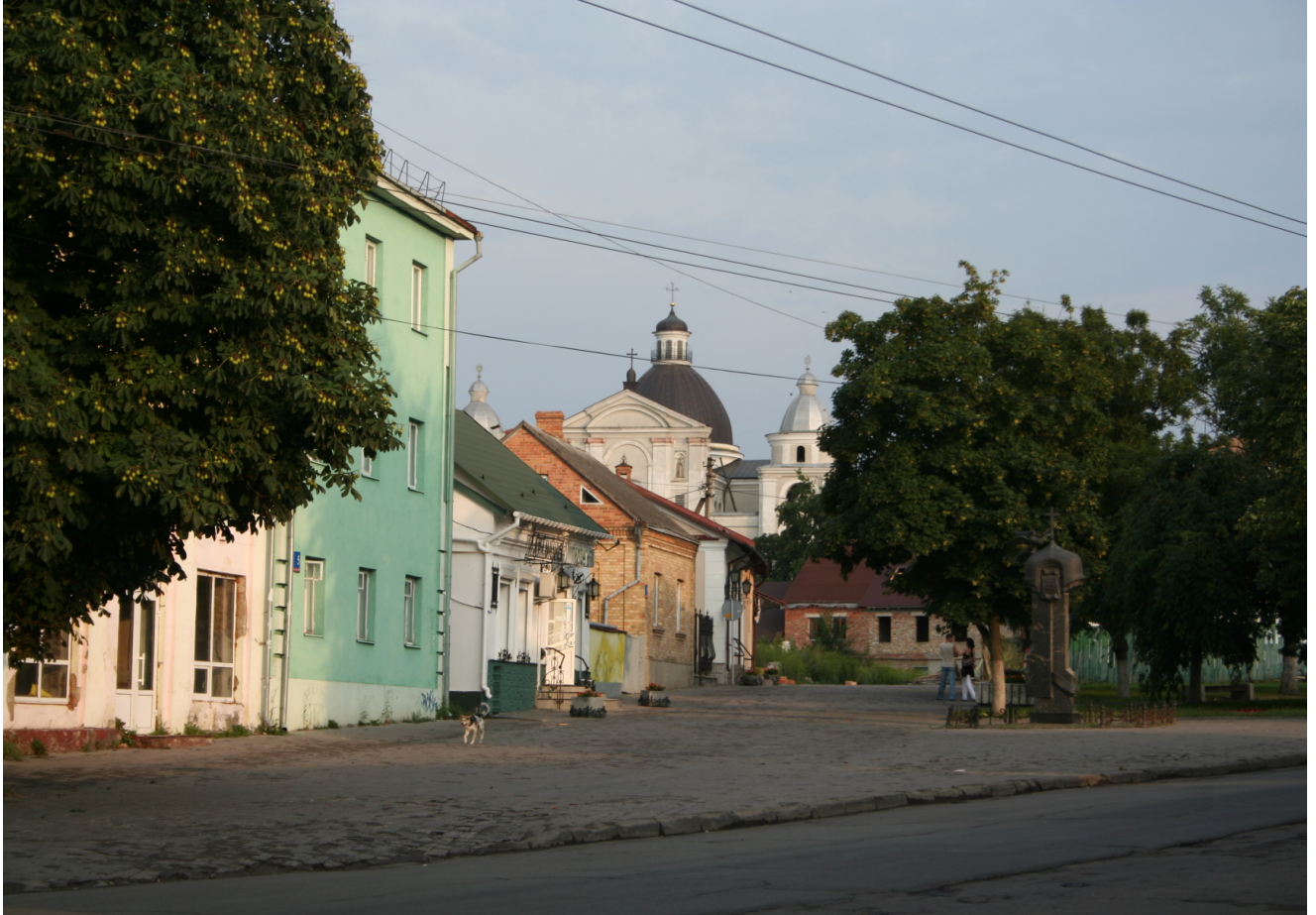
The Market Square and surrounding territory of the future City Cultural Centre