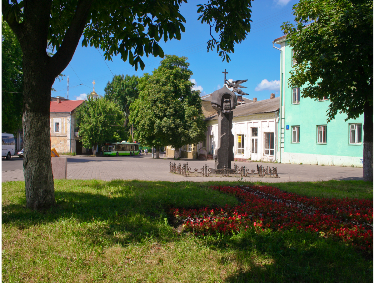
The Market Square and surrounding territory of the future City Cultural Centre