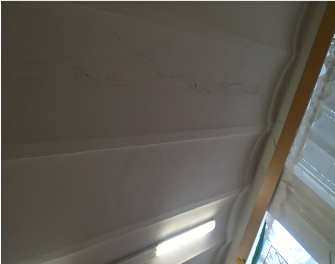
An arched ceiling inside the building