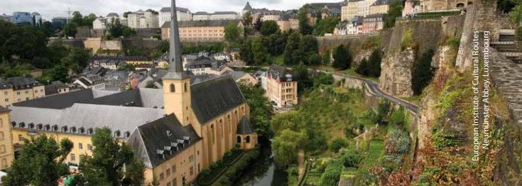
European Institute of Cultural Routes Neumünster Abbey, Luxembourg