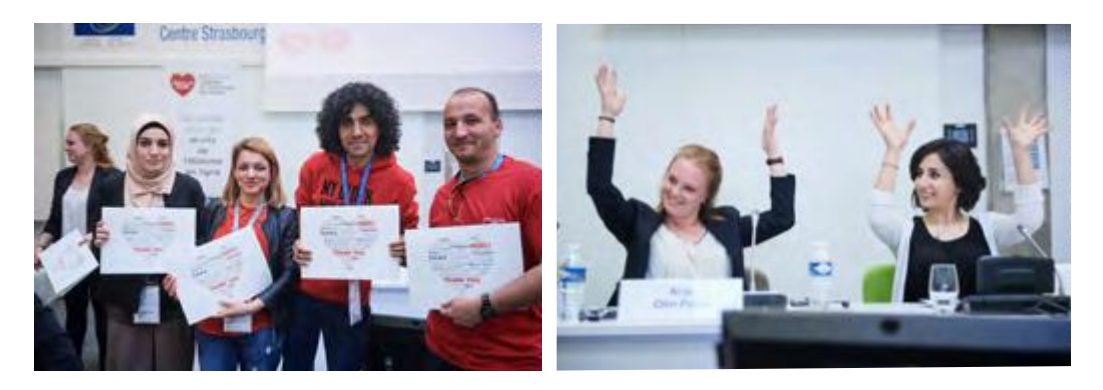
Activists all over the world have stepped up their efforts in denouncing fake news, hate speech and excluding narratives.