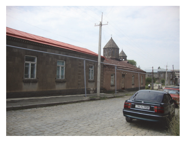
Picture 16. Rustaveli Street one-story residential Picture 17. Construction on the territory adjacent houses