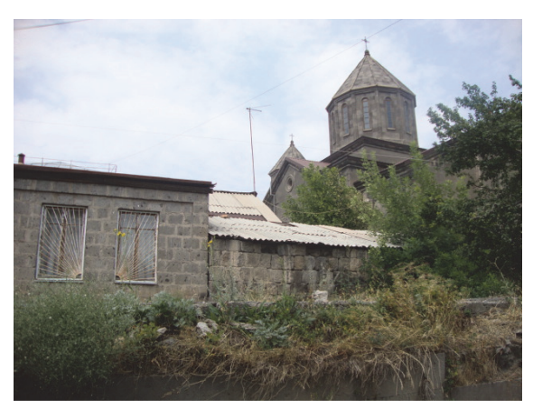
to Saint Nshan church /not a monument/