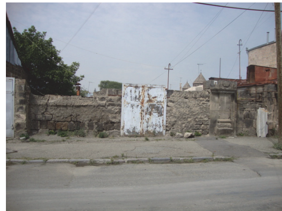
Picture 9. Yard of the Residential House in Picture 10. Residential house of Varpetats Street Varpetats Street