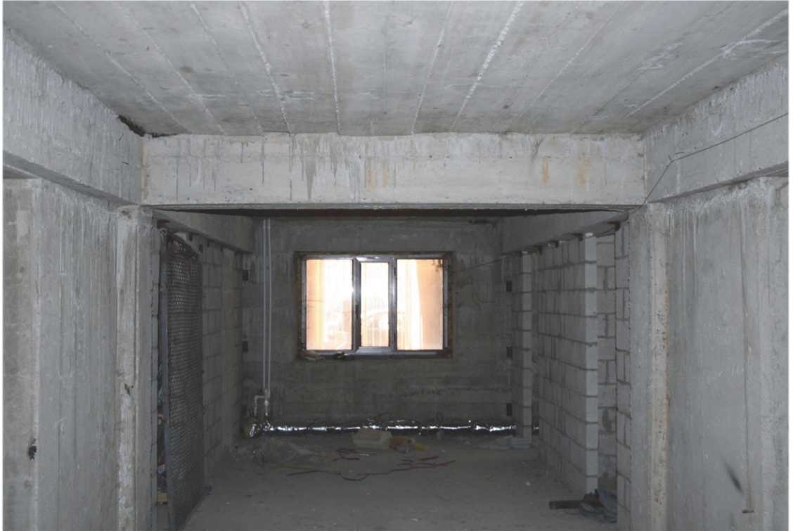
Picture 7. Inner space of the area