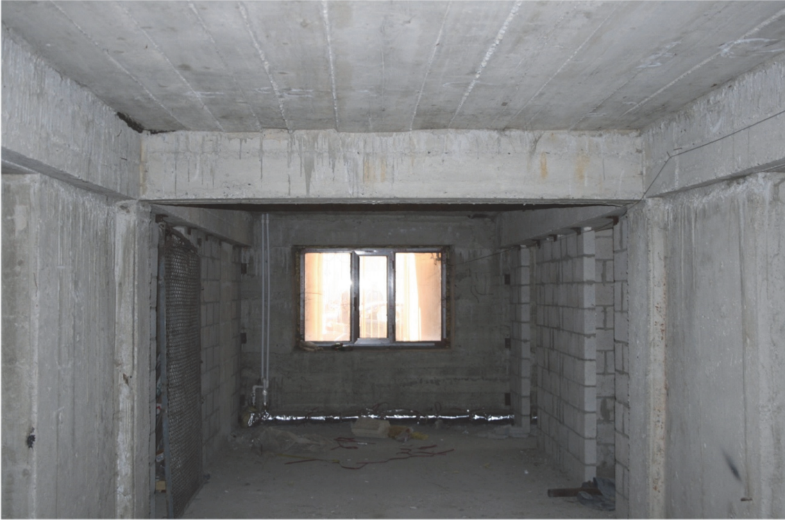
Picture 8. Inner space of the area