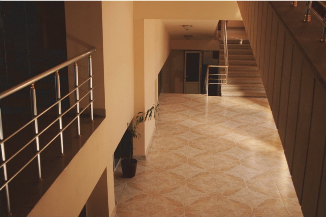
Picture 6. Entry to the area from the Municipality building