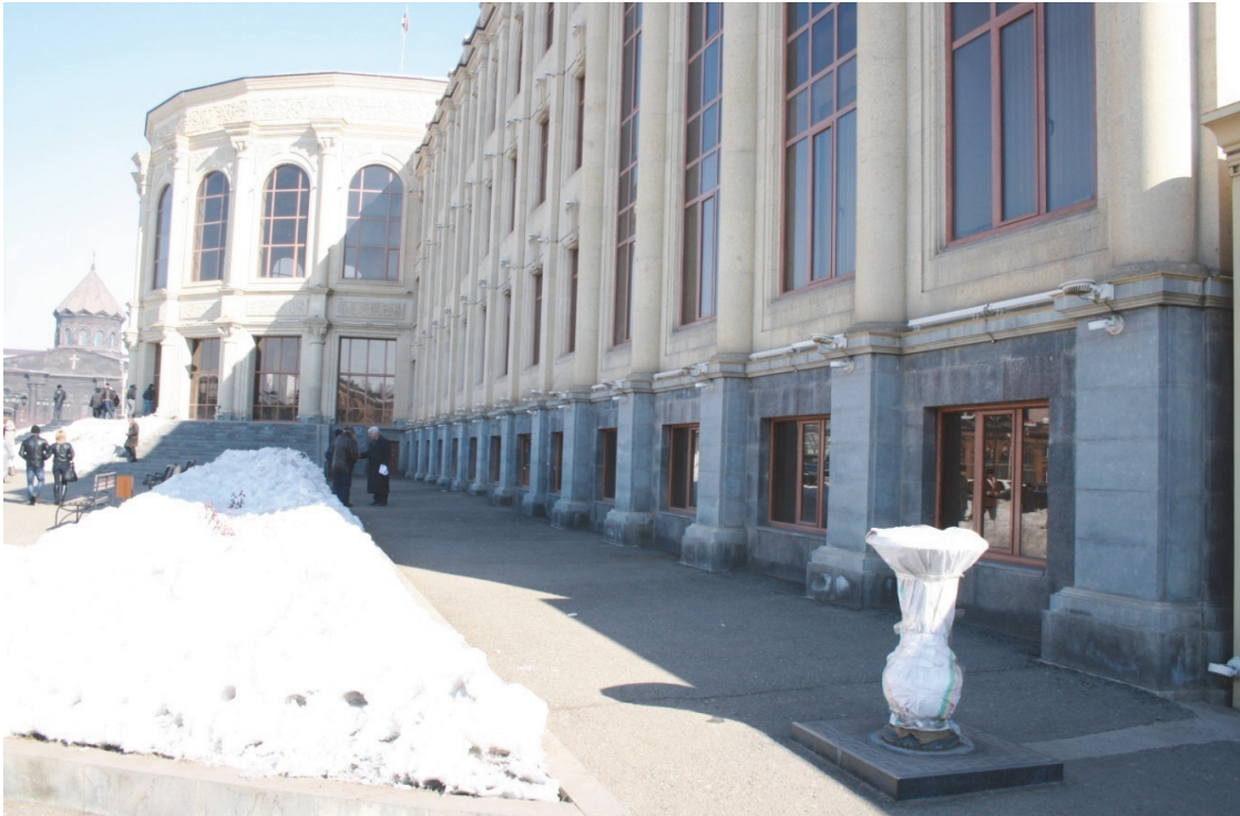
Picture 4. The area viewed from Vardanants Square