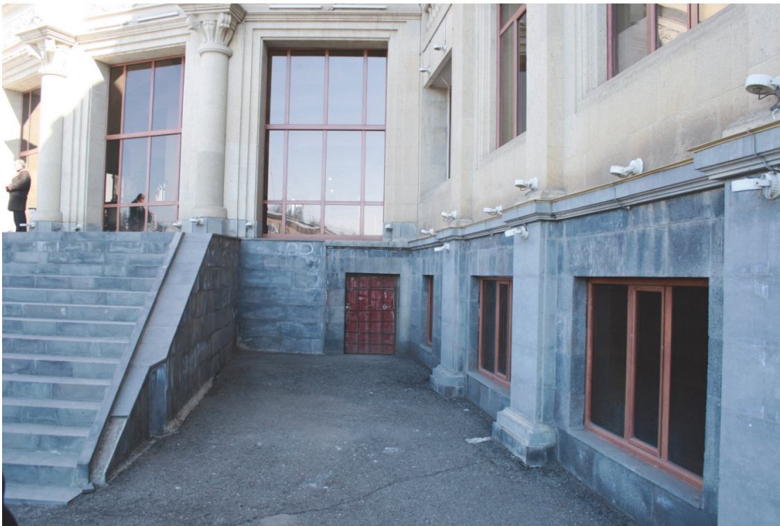
Picture 5. Entrance of the area from Vardanants Square