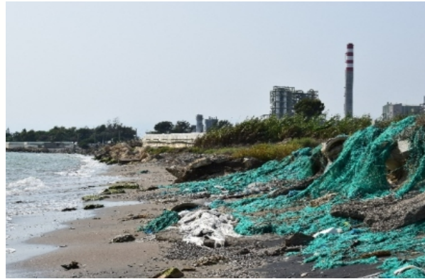
Discarded greenhouse nets