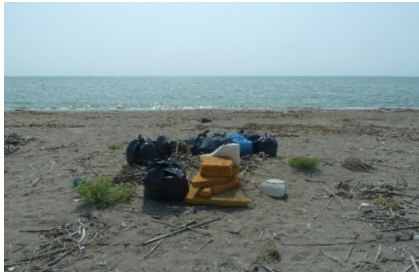
Garbage collected but not removed from the beach

Marine debris was observed along the entire coast.