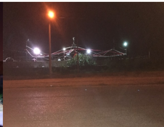
Artificial light from the wedding hall (K2 section)