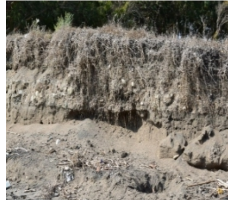
Effects of severe coastal erosion

Effective remedial measures need to be applied as a matter of great urgency.