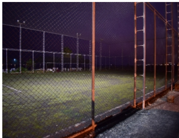
Artificial light from the football court (K2 section)

Photo-pollution on the beach is clearly evident. No light screening has been installed.