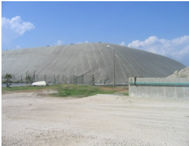
View of the toxic waste slopes in 2015