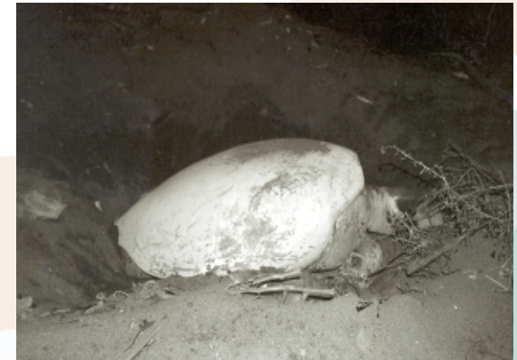
Nesting green turtles are encrusted with calcium carbonate compounds due to the factory's discharges into the sea.