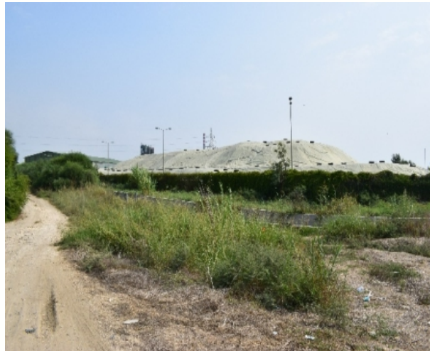
View of the toxic waste slopes in 2017