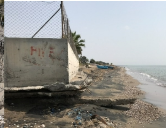
Erosion of the coastline affecting the concrete wall of the local school yard