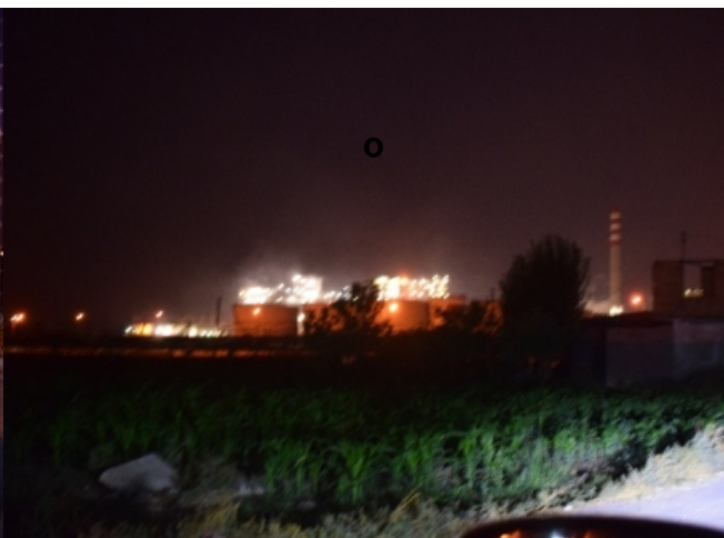
Soda-Chrome factory at night (K4 section)