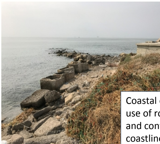
Coastal erosion in K3 area; ineffective use of rocks and concrete blocks to halt and control the severe erosion of the coastline