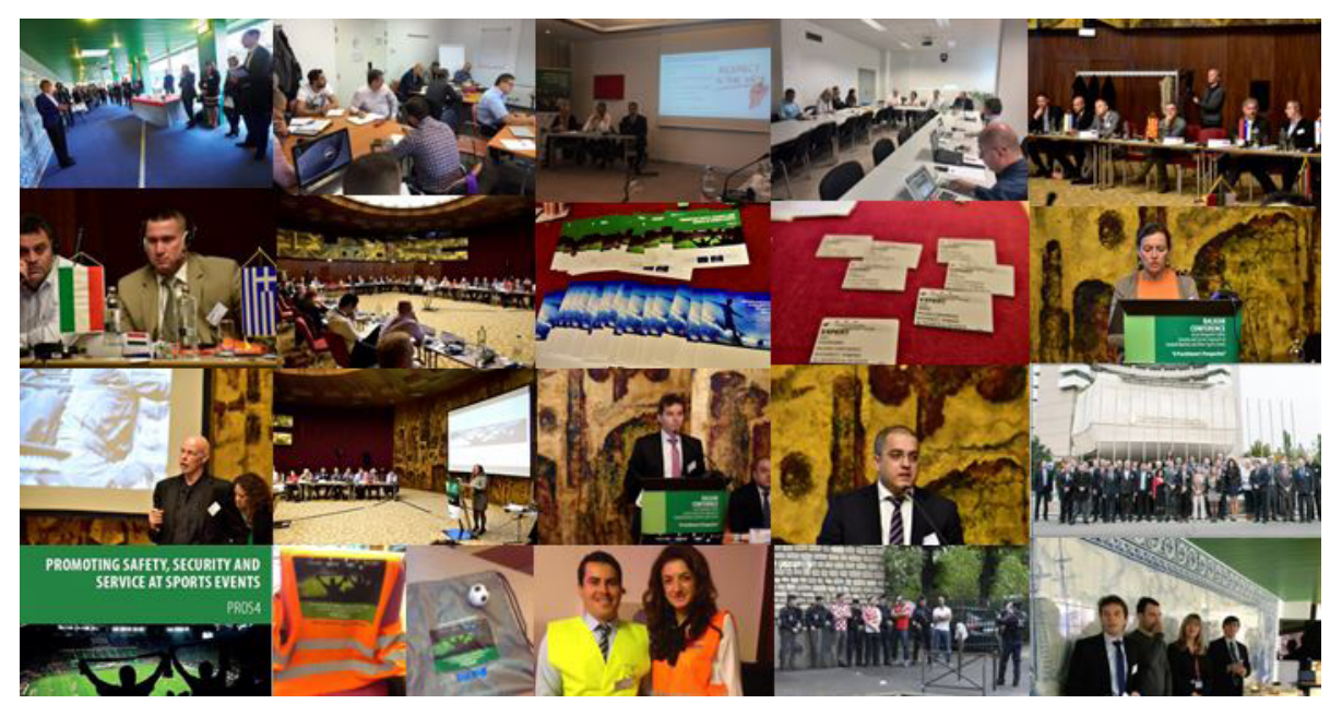
Initiatives taken under EU-Council of Europe joint project ProS4