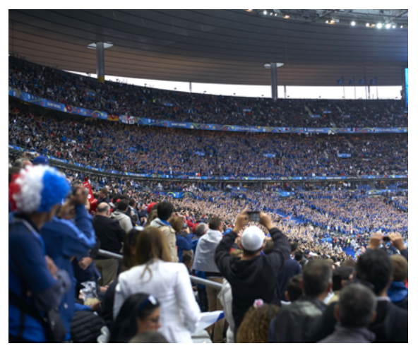
UEFA EURO 2016, quarter-final match France-Iceland, Stade de France (Saint-Denis, France), 3 July 2016