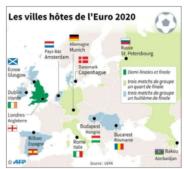
Map of the hosting cities of UEFA EURO 2020

JJ UEFA EURO 2020 is an exceptional opportunity to implement European-wide common standards