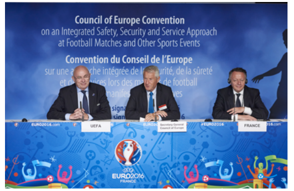
Ceremony of opening to signature of the new Convention, Stade de France (Saint-Denis, France), 3 July 2016