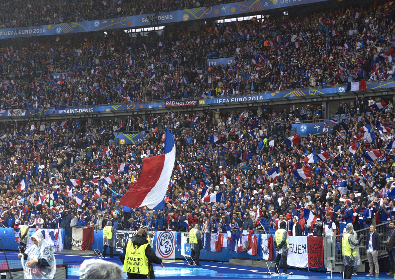
UEFA EURO 2016, quarter-final match France-Iceland, Stade de France (Saint-Denis, France), 3 July 2016