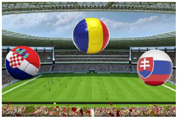
ProS4 joint project initiative on three national action plans on an integrated approach (Romania, Croatia and Slovak Republic)