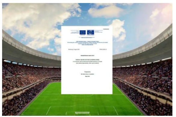
2015 annual report on sport-related violence across Europe (ProS4 joint project)

With a view to providing technical support to member states, the standing committee established