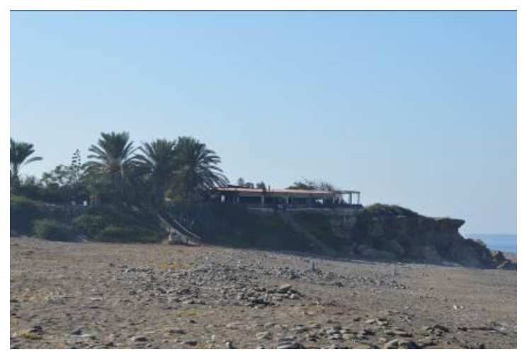
Appendix D Illegal interventions and activities in Akamas Peninsula and Polis-Gialia Natura 2000 sites