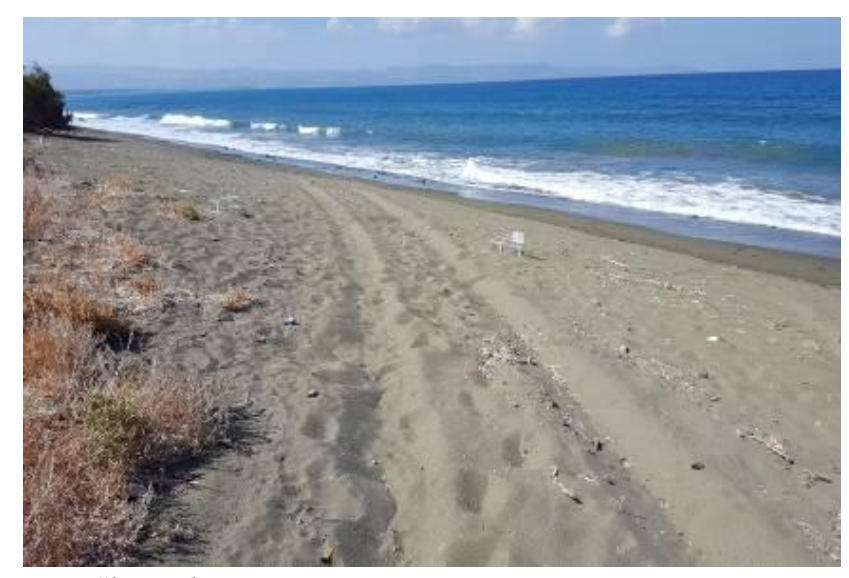
Illegal driving upon the sand dunes and the sea turtles nesting beaches in Polis-Gialia area, Chrysochou Bay