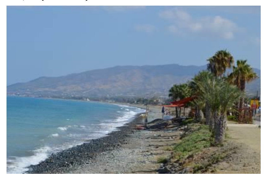
Illegal sunbeds and kiosks upon the sand dunes and the sea turtles nesting beaches in Polis-Gialia area, Chrysochou Bay