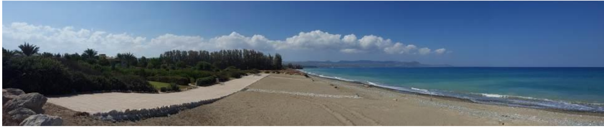
Pedestrian road constructed upon the sand dunes and the sea turtles nesting beach in Limni area, Chrysochou Bay