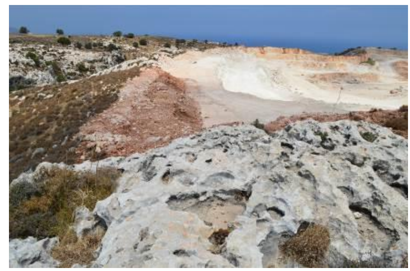
Illegal expansion of limestone quarries in Kranazi area, Androlikou Gorges, Akamas Peninsula