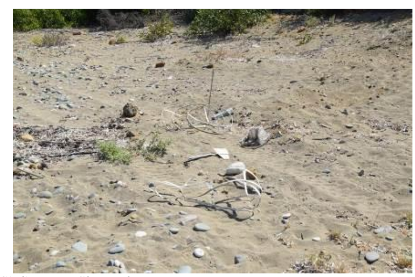
Illegal driving and destruction of sea turtle nests by quad bikes in Limni beach, Polis-Gialia area, Chrysochou Bay