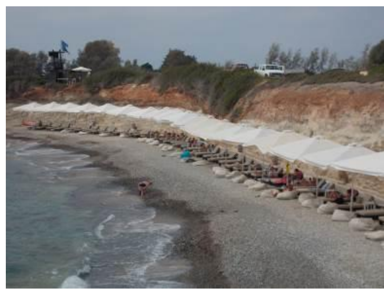
Illegal earthworks, beach alteration, direct lighting and sunbeds with umbrellas in Kafizis area, Sea Caves in Pegeia, Akamas Peninsula