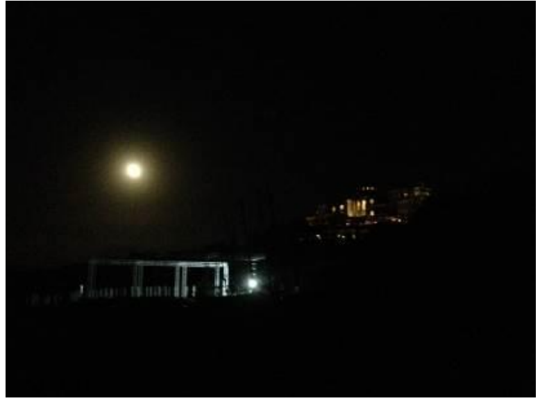
Illegal earthworks, beach excavation and direct lighting during a wedding ceremony in Asprokremos - Chalavron area, Akamas Peninsula