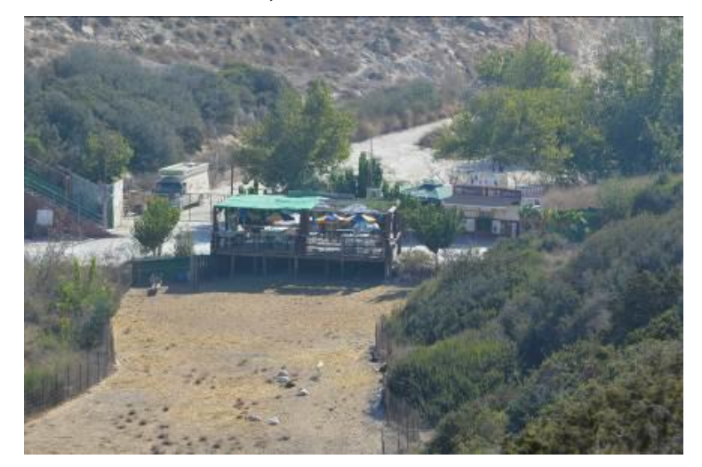
Illegal restaurant, snack bar and kiosk in Aspros River, near Lara-Toxeftra Marine Protected Area, Akamas Peninsula