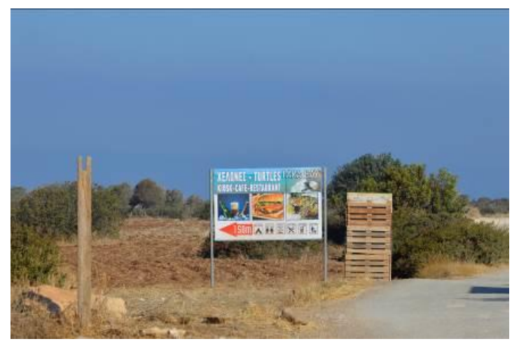
Illegal restaurants and beach bars in South Lara Bay, within and adjacent to Lara-Toxeftra Marine Protected Area, Akamas Peninsula