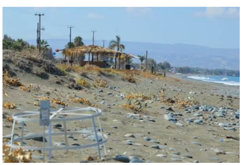
Illegal driving and beach bars upon the sand dunes and the sea turtles nesting beaches in Polis-Gialia area, Chrysochou Bay