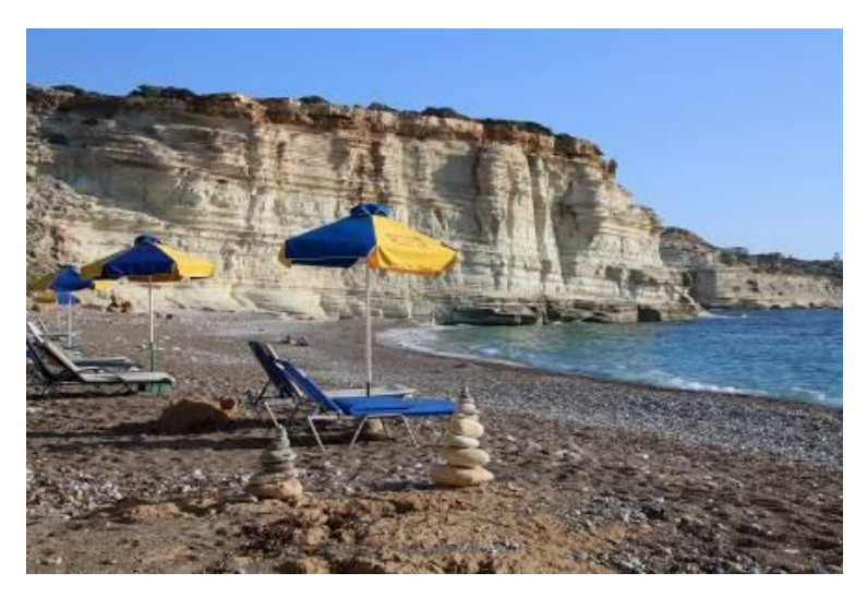
Illegal sunbeds in Aspros River estuary, within Lara-Toxeftra Marine Protected Area, Akamas Peninsula