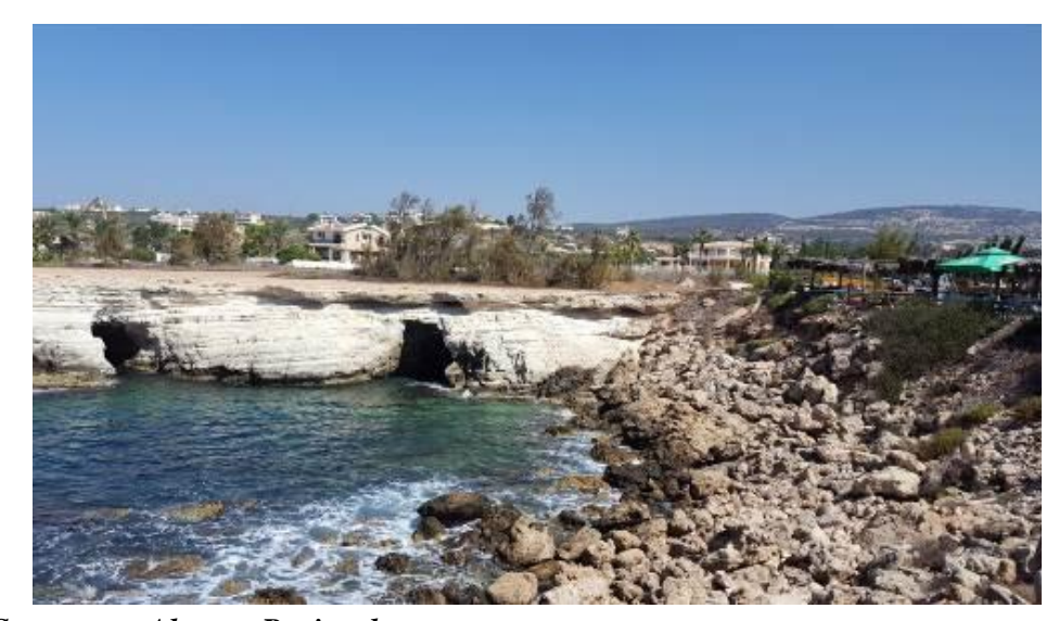
Uncontrolled anchoring of inflatable boats and illegal beach bars in Pegeia Sea Caves area, Akamas Peninsula