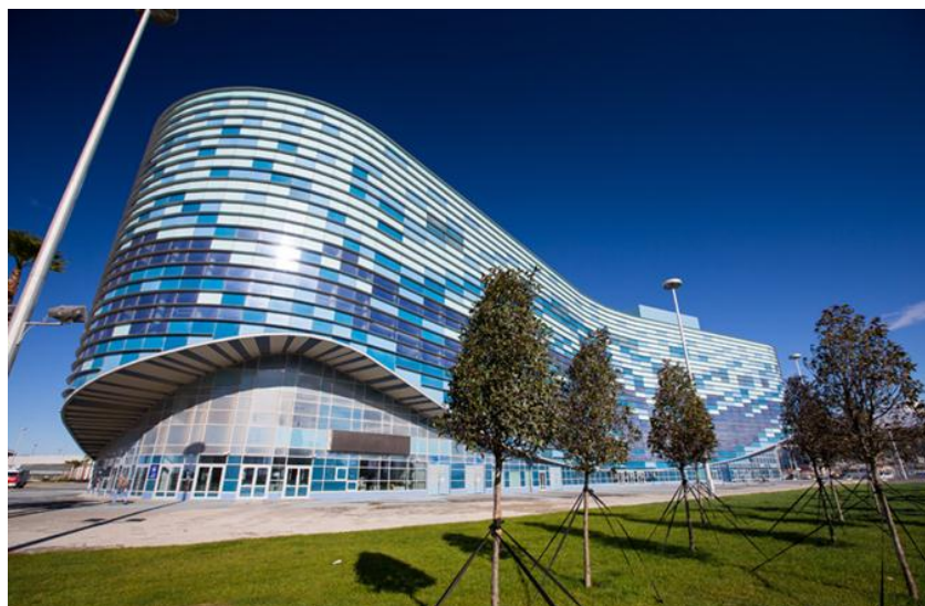
Iceberg Skating Palace, Sochi