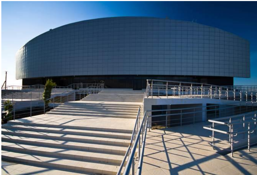
"Ice cube" curling centre, Sochi

I wish to thank again, on behalf of the Council of Europe, the Russian authorities for hosting this event, and especially Minister MUTKO for his personal engagement in making it a success.