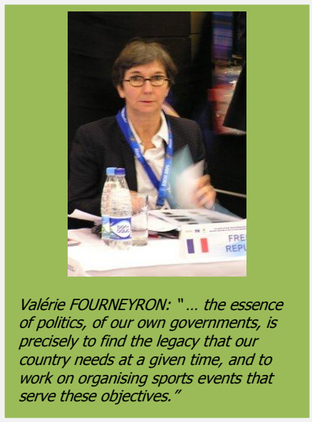
Valérie FOURNEYRON: "... the essence of politics, of our own governments, is precisely to find the legacy that our country needs at a given time, and to work on organising sports events that serve these objectives."

Ms Valerie FOURNEYRON, Minister of Sport of France, underlined the need to establish a feasibility study of economic impact before hosting a major sport event. Ms FOURNEYRON explained that the impact of the legacy of major sports events can be seen to lie in three main