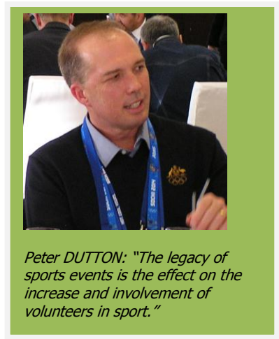
Peter DUTTON: "The legacy of sports events is the effect on the increase and involvement of volunteers in sport."

The following participants took the floor during the discussions: Peter DUTTON, Minister of Sport of Australia; Azad RAHIMOV, Minister of Youth and Sport of Azerbaijan; Alexandr SHAMKO, Minister of Sports and Tourism of Belarus; Bal GOZAL, Minister of Sport of Canada; Anita LEHIKONEN, Permanent Secretary of Ministry of Education and Culture of Finland; Klemensas RIMŠELIS, Director General of Physical