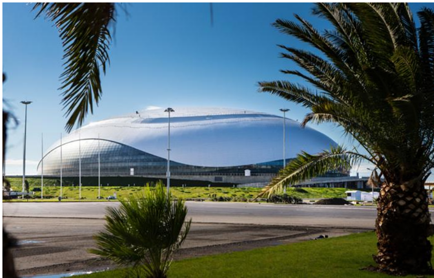
Bolshoy Ice Dome, Sochi