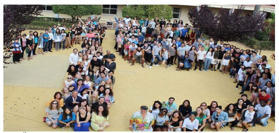
15<sup>th</sup> University on Youth and Development (Mollina, Spain – 2014)