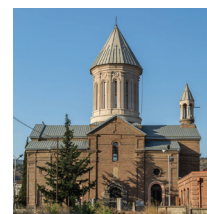
Surb Echmiadzin Church, Tbilisi

The Armenian language belongs to the Indo-European family of languages and has its own script, which is among the world’s main 14 alphabets. According to some historians, the Armenian population first appeared in Georgia in the 2nd century BC. Kings Erekle II and Giorgi XII established Armenian settlements in Georgia in the 17th and 18th centuries. A significant number of Armenians moved to Georgia in 1828-29, 1877-89, 1895-96 and 1915 because of the Russian-Turkish war. The Armenians, who are Christians, mostly live in Tbilisi and in the Samtskhe-Javakheti and Abkhazia regions. They have been represented by many artists, scholars, doctors, sportsmen, entrepreneurs and merchants. Armenians have also contributed considerably to the architectural development of Tbilisi. Currently, Armenian is the language of instruction in up to 131 schools. There are a number of Armenian arts ensembles and cultural centres in Georgia. Newspapers, magazines (e.g. the weekly Vrastan and monthly Arevik ) and literature are published in Armenian. The Georgian Public Broadcaster has daily TV (Channel 2) and radio information programmes in Armenian. Regional TV and radio stations broadcast in Armenian in Samtskhe-Javakheti. The website of the National Parliamentary Library of Georgia hosts an Armenian-Georgian online dictionary.