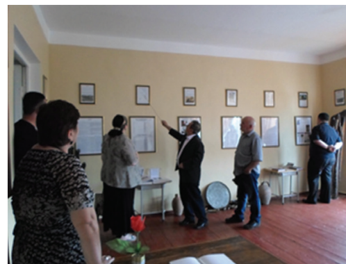
Museum of Udi Culture, Zinobiani