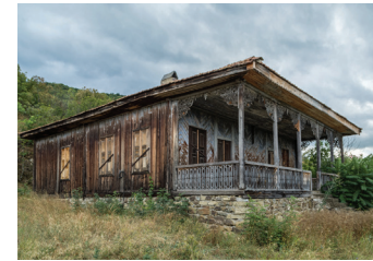
Abkhazian house at the Tbilisi Ethnographic Museum

The Abkhazian language belongs to the Ibero-Caucasian family of languages and employs the Cyrillic script. Historical records from the 1st and 2nd centuries AD mention the Apsilae and Abasgoi tribes on the Black Sea littoral of present-day Georgia. Some researchers consider that they originated from South-Caucasian (Kartvelian) tribes, but others believe that they came from North-Caucasian Adyghe tribes. The majority of Abkhazian-speaking people have traditionally lived in Abkhazia. Some Abkhazians are Christians, others are Muslims. Abkhazian has state-language status within Abkhazia, leading to several state agencies in Georgia uploading documents and information in Abkhazian onto their websites. Until the conflict in the 1990s, Abkhazian had been widely used at schools, universities and in the media in Abkhazia. However, access to exact information about the current situation of this language in Abkhazia is not possible. In Tbilisi, Abkhazian was first taught at Ivane Javakishvili State University in 1924. In order to enrol into Georgian universities, Abkhazian speaking applicants can take only one entrance exam (general skills) in Abkhazian. The Georgian Public Broadcaster does schedule daily TV (Channel 2) and radio information programmes in Abkhazian. An Abkhazian-Georgian online dictionary is available on the website of the National Parliamentary Library of Georgia.