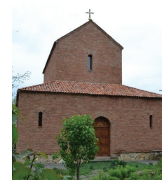
Church of the Thirteen Assyrian Fathers in Dzveli Kanda-Georgstal