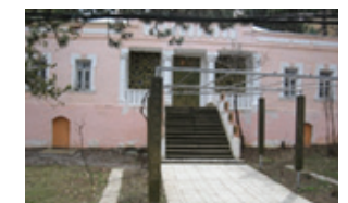
Lesya Ukrainka House Museum in Surami