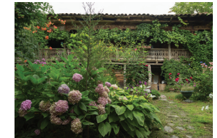
Kist house in Duisi-Dui