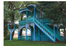
Orphanage in Gorelovka

The Russian language belongs to the East Slavic group of languages. The long-standing Russian-Georgian relationship was enhanced through the marriage of Queen Tamar and George the Rus' (Yury Bogolyubsky, Prince of Novgorod) in the 12th century. The dense settlement of Russians in Georgia started in the 19th century when the Kingdom of Kartli and Kakheti was abolished. The Russians living in Georgia have contributed to the development of science, culture, industry and other fields. In the Soviet era and today, Russian is used as a means of communication between different ethnic groups. Russian is the language of instruction at 75 schools and several universities. Furthermore, Russian is used by several Russian cultural centres and many artistic groups in Georgia. A number of newspapers (e.g. the weekly Svobodnaya Gruzia , and monthly Mnogonatsional'nyaya Gruzia ), magazines and books are published in Russian. The Georgian Public Broadcaster has daily TV (Channel 2) and radio information programmes in Russian. Some places in Georgia have Russian names, for example, Gorelovka.