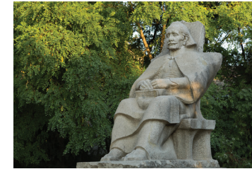
Dimitri Gulia monument, Tbilisi