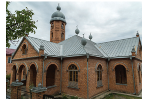
Mosque in Duisi-Dui

The Chechen language belongs to the Ibero-Caucasian family of languages and uses the Cyrillic script. The Chechens residing in Georgia are referred to as Kists and are mostly Muslims. The Kists are mainly engaged in agriculture and cattle breeding. According to historical records in Georgia, King Parnavaz of Kartli married a Kist woman from the North Caucasus in the 3rd century BC, which reflects the traditionally multi-ethnic nature of the Kartli Kingdom. The son of Parnavaz, King Saurmag, settled Kists in mountainous areas in Eastern Georgia. The next immigration of Kists into Georgia took place in the 13th century. However, the Kists living in the Pankisi Gorge area in the Kakheti region did not settle in Georgia until the 18th and 19th centuries. The Chechen language was taught in schools throughout Kist villages until it stopped in 1944. More than 70 years later, five secondary schools will once again start offering Chechen language classes from September 2016. Several Chechen folklore ensembles exist in Pankisi Gorge. The bilingual (Georgian-Chechen) radio WAY has started radio broadcasting (live streaming online) in twelve villages in the Pankisi Gorge, from villages Koreti to Khadori. Alas, Chechen is currently not used in any print media.