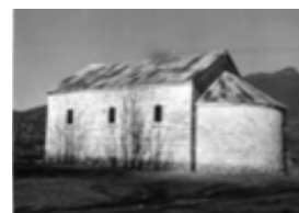
Greek church in Azanta (Abkhazia)

The Greeks speaking Urum Turkish moved from the North-Eastern territories of Turkey to Georgia during the 19th century (in three migration waves) and settled mostly in the Tsalka and Dmanisi districts of the Kvemo Kartli region. Urum Turkish has never been taught at schools or used in public life. At present, it is mainly spoken by elders in the families residing in Tsalka district. The younger generation mostly learns modern Greek.