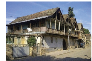
German house (the Walker-Haus) in Bolnisi-Katharinenfeld