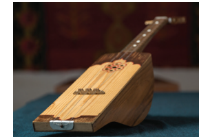
Kist musical instrument