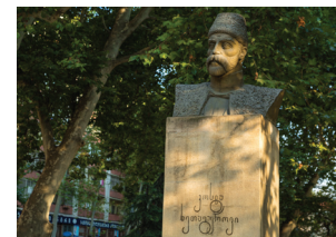
Monument of Konstantin (Kosta) Khetagkati, or Kosta Khetagurov (1859-1906) national poet of the Ossetian people, Tbilisi

The Ossetian language belongs to the North-Iranian group of the Indo-European family of languages and uses the Cyrillic script. Some scholars claim that a compact settlement of Ossetians was established in the 3rd and 4th centuries, whereas others argue that it happened in the 13th and 14th or in the 17th and 18th centuries. Currently, the majority of Georgian Ossetians live in the Shida Kartli and Kakheti regions, as well as in Tbilisi. The Ossetians are mostly Christians. Ossetian was being taught in more than 50 schools in Georgia until 2012. Since 2015, secondary schools in Tsitskanaantseri (Kvareli district) as well as in Poni and Areshferani (Lagodekhi district) have resumed teaching Ossetian. Ossetian has also been taught at Ivane Javakhishvili Tbilisi State University since 1918 where, in 2015, the Scientific-Research Centre of Georgian-Ossetian Relations was created. A Georgian-Ossetian online dictionary can be accessed on the website of the National Parliamentary Library of Georgia. The Georgian Public Broadcaster has daily TV (Channel 2) and radio information programmes in Ossetian. Different publications and books are printed in Ossetian, while many folklore ensembles and artistic teams use Ossetian.