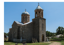
Greek church in Tsalka