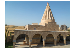
Yezidi temple, Tbilisi