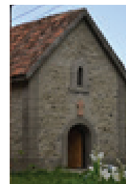
Church of the Assumption of the Virgin Mary in Dzveli Kanda-Georgstal

The Assyrians speak Assyrian New Aramaic, using the Aramaic script. The Assyrian Christian clergymen, known as the Assyrian Fathers, came to Georgia in the 6th century and significantly contributed to the development of Christianity. Modern Assyrian settlement in Georgia started in the 18th century when King Erekle II settled refugee Assyrians in the Kakheti region. During the second half of the 19th and early 20th centuries more Assyrians came to Georgia in several waves from Persia and Turkey. They settled in Tbilisi, Zestaponi, Kutaisi, Samtredia, Senaki, Batumi and Gardabani, and in the village of Dzveli Kanda (Georgstal in German) in Mtskheta district. The tradition of teaching Assyrian in Georgia ended in the 1940s when a number of Assyrians were deported. In 2015, teaching Assyrian was reintroduced at Dzveli Kanda Secondary School with the support of the Ministry of Education of Georgia. Assyrian is also being taught at the Assyrian Cultural Centre in Tbilisi, which was founded in 2009. Liturgy in churches is conducted in Aramaic.