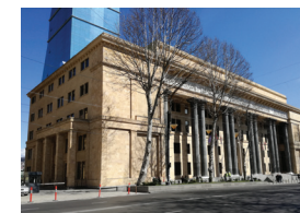
IMELI Building (former Institute of Marx, Engels, Lenin), Tbilisi, by Alexey Shchusev