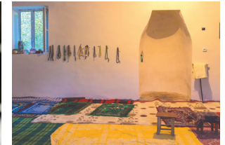
Avar prayer house in Tivi