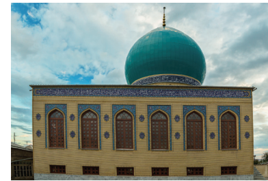
Imam Hussein mosque in Marneuli