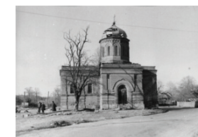
Berdznis church in Algeti