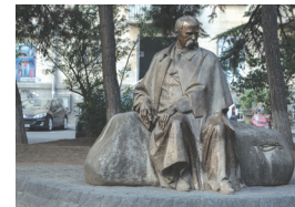
Monument of Ukrainian poet, Taras Shevchenko, Tbilisi

The Ukrainian language belongs to the East Slavic group of languages and uses the Cyrillic alphabet. The Ukrainians, who are mostly Christians, first settled in Georgia in the second half of the 18th century when, because of disobedience, the Russian Empress, Catherine II, disbanded the so-called “Zaporozhian Sich” (a semi-autonomous Cossacks’ polity in the 16th to 18th centuries in Ukraine). In the early 19th century, Russian troops including Ukrainian soldiers were sent to Georgia. After finishing their military service, some of the Ukrainians settled in Georgia on plots of land assigned to them close to their military base. Ukrainians live in Tbilisi, Sokhumi (Aqwa in Abkhazian), Batumi, Rustavi, Kutaisi and Poti. The “Lesyaoba” folk festival, dedicated to Ukraine’s poet and writer, Larysa Petrivna Kosach-Kvitka (pseudonym: Lesya Ukrainka), is annually celebrated in Surami (Khashuri district). In 1999, the Ukrainian-Georgian Public School was opened and named after Mykhailo Hrushevsky.