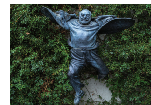
Monument of Sergei Parajanov, Tbilisi