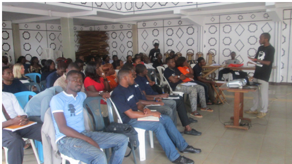
Cameroonians to Germany, related to youth entrepreneurship.

— Participants: 23 young women and 23 young men from Cameroon.