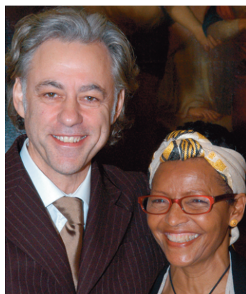
Bob Geldof and Bogaletch Gebre, 2005 prizewinners.

Based in Lisbon, the North-South Centre of the Council of Europe was established in 1989 as a Partial Agreement in order to provide a framework for European cooperation designed to heighten public awareness of global interdependence issues, and to promote policies of solidarity complying with the Council of Europe's aims and principles.