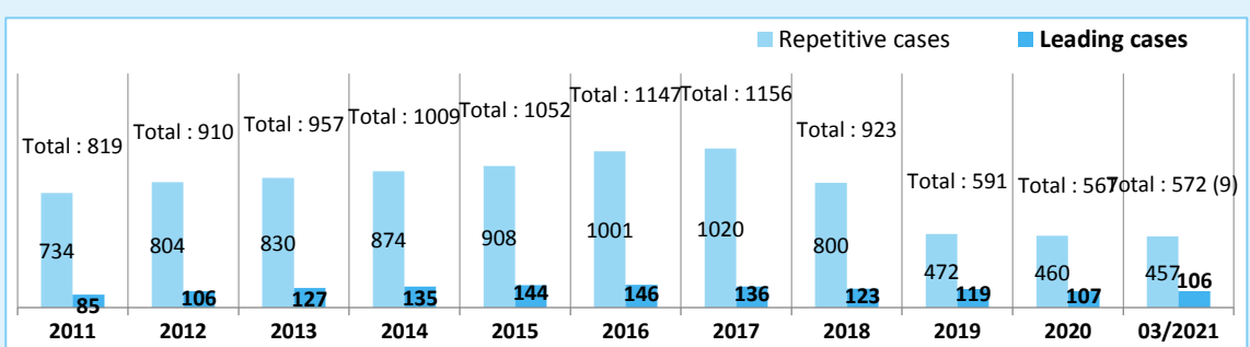
Figures bracketed correspond to the number of cases not yet classified as leading or repetitive, but they are taken into account in the total number of pending cases.