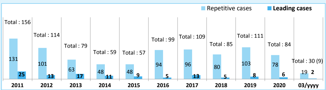
Figures bracketed correspond to the number of cases not yet classified as leading or repetitive, but they are taken into account in the total number of new cases.

(judgments transmitted for supervision of their execution during the year)