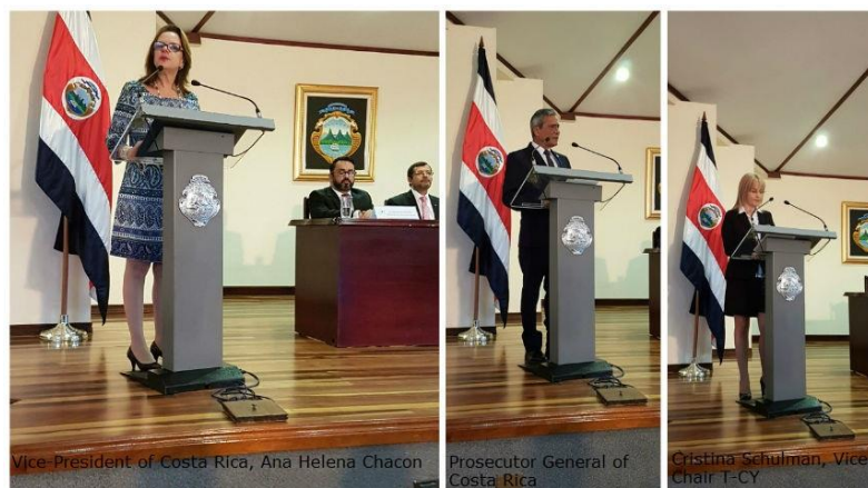
Vice-President of Costa Rica, Ana Helena Chacon