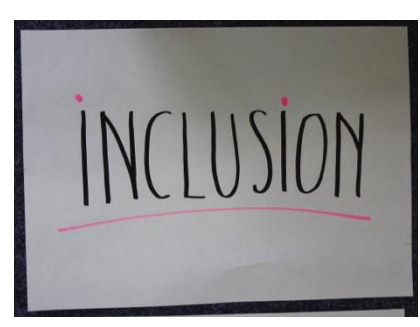
Sign with the word inclusion

We could describe the programme of the study session as a flow going through five different parts: