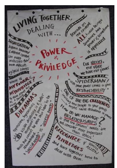
Poster summarizing the discussion on power and privilege

When discussing challenging discrimination, is was recognised that peer support, gaining respect from others and getting inspiration from others are key when the participants were asked what encourages and motivates them. The group reflected that it is important for oppressed or marginalised groups to look outside of their struggle and show solidarity with other oppressed or marginalised groups to work together for meaningful societal and social change.