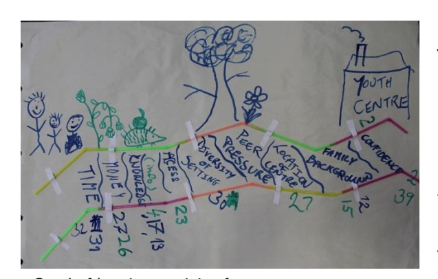
Road of barriers activity from one group

To introduce children's rights, the participants took part in a bingo game on the UN Convention on the Rights of a Child (UN CRC), before working out the barriers to accessing children's rights and discussing how being aware of children's rights can assist in fighting for inclusion. This was done through the participants thinking about what barriers a child or young person may face when trying to access a youth group - whether in terms of physical, emotional, educational, socioeconomic or psychological