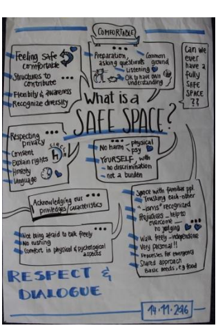
Poster summarising the discussion 'what is a safe space?'

The participants started on the first day to think about what it means to create a safe(r) space, from a psychological and physical perspective, and why a complete safe space isn't possible because we reflect the structurally oppressive and discriminatory world we live in through our behaviours unconsciously. The participants discussed how personal boundaries vary from person-to-person and how to respect these, while setting common ground rules in the group. This started the participants on a thought process of how to be aware and recognise