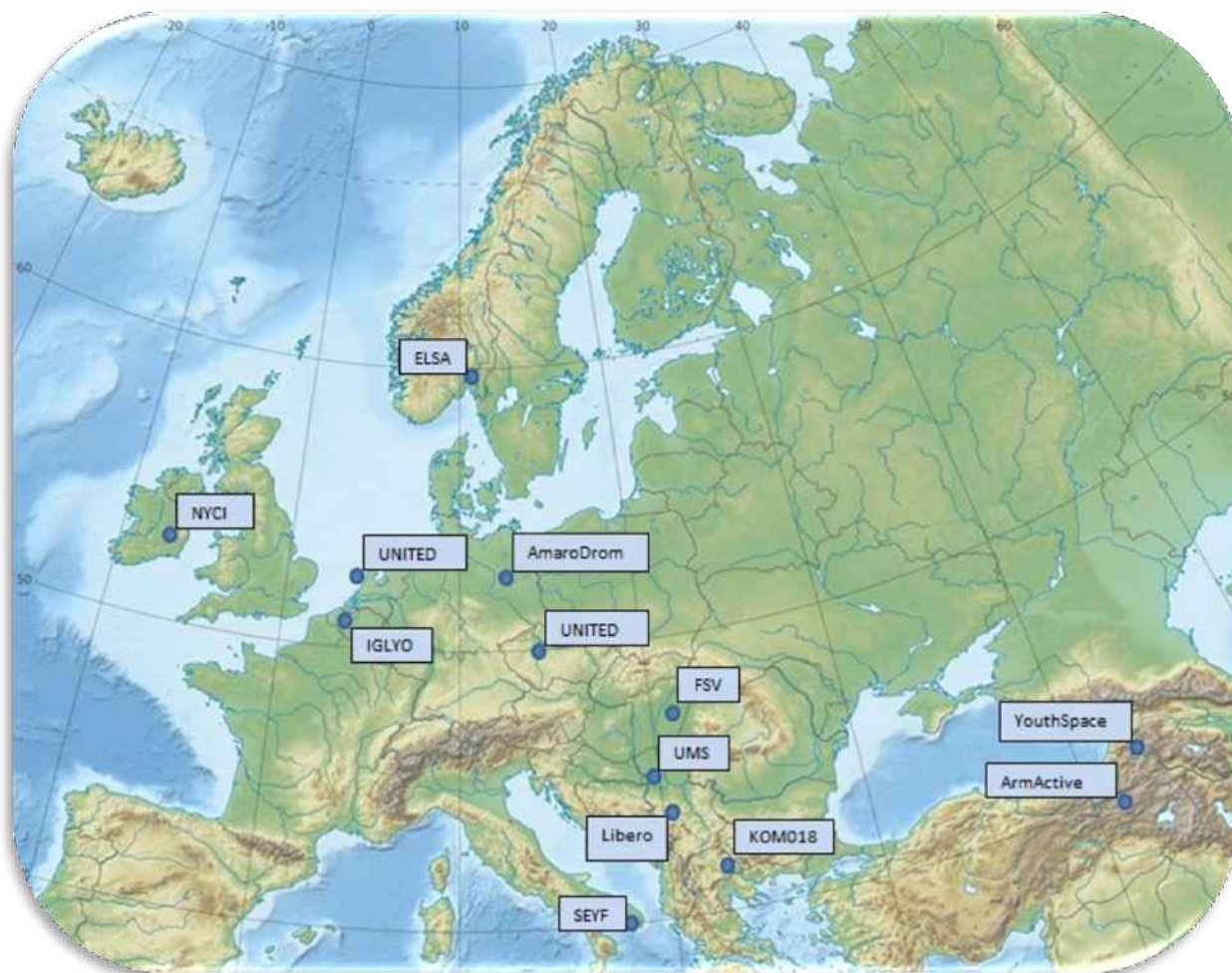
Map illustrating the projects supported by the European Youth Foundation within the framework of the No Hate Speech Movement campaign and presented in this publication.