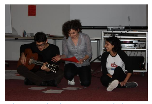
What was the funniest part of the program? The part of workshop when we should use one instrument of art to send our message about youth and what are our needs. I liked that all members of the group were involved and participated

The evening ended up with the 2<sub>nd</sub> part of the international evening, where everybody had an opportunity to taste food and drinks from different countries as well as to learn traditions and customs of the countries represented.